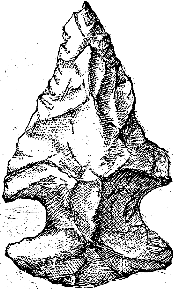
3 TIMES NORMAL SIZE.