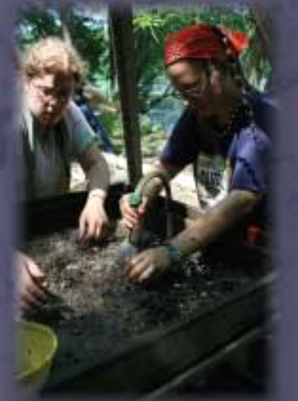
Field school students wet screen dirt to find artifacts.