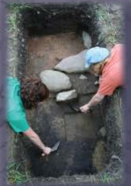
Field school students use trowels to carefully uncover a fireplace at Fort St. Joseph.

As archaeologists dig, detailed notes are kept about what is found and what is seen in the soil. They also make drawings, take photographs and make maps and video tapes to further record their findings.