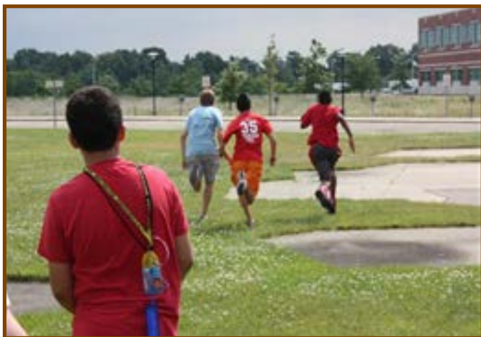
Middle school students participating in one of the activities