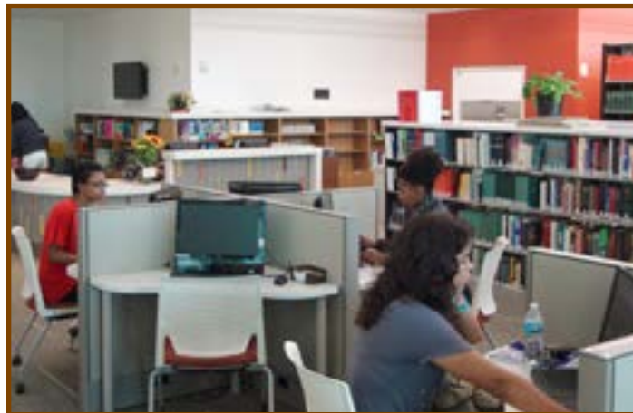
New Education Library in Sangren Hall