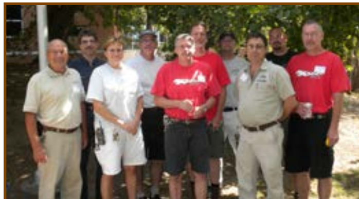
University Libraries summer picnic recognizes University colleagues who support its mission. Here featured are members of Facilities Management team.

Open House in October: University Libraries (Waldo Library location) will participate in Buster's Family Weekend Adventures by offering family activities for students, parents, and siblings on Friday, October 26, 2012. We shall host an Open House, "Excursions in An Academic Library," from 1 to 5:00 p.m. Participants will travel to "destinations" within Waldo Library staffed by library professionals. These "adventures" will include: A Display of Rare and Unusual Books (the oldest, smallest, and heaviest) in Special Collections; The WMU Authors' Corner: Publications of WMU Faculty; and University Legacies: Examples of Yearbooks, Photos, and Artifacts from WMU's Past. While these bibliophilic excursions are open to everyone, University Libraries extends a special invitation to the families of Library Student Employees to tour "the library workplace." Refreshments and library mementos will be offered to all participants.