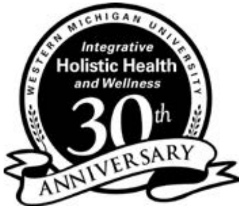
Holistic Health Care program 30th Anniversary event October 20, 5 to 7:30 p.m. at the Health and Human Services building