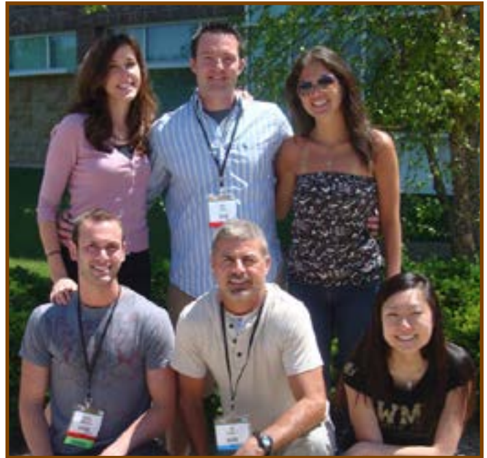
First year Physician Assistant students and faculty who attended the annual AAPA Conference in Toronto, Ontario