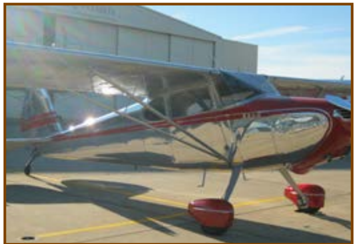
One of 15 aircraft who participated in the breakfast.

On September 15, 2012, WMU students, faculty and staff, along with the community, enjoyed flying pancakes in the hangar at the College of Aviation. Over 250 guests were enthusiastically served by Chris Cakes. Guests also enjoyed the opportunity to visit with the 15 pilots who flew their aircraft into the college specifically for the event. One college Registered Student Organization, Alpha Eta Rho, also used the breakfast as an opportunity to meet the Eastern Michigan University chapter by inviting them to come to WMU to participate in the event. The timing of the event coincided conveniently with Governor Snyder's declaration that September 2012 is Michigan Aviation Month.