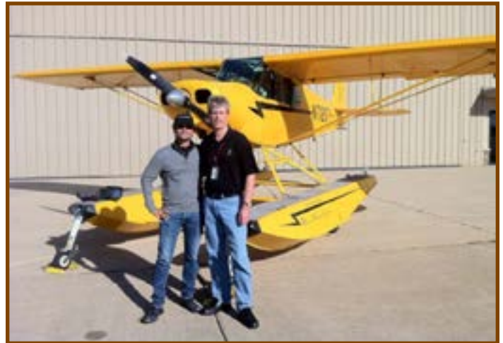
Great day for a float plane flight!