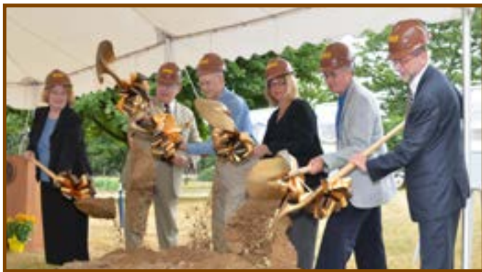
Leaders of WMU break ground for the new Legacy Collections Center July 19