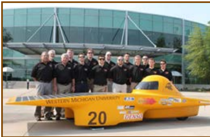
2012 Sunseeker Team

It is no surprise that the Sunseeker team won the 2012 Solar Race Sportsmanship Award. After helping out fellow competitors, the Sunseeker team received the 2012 Solar Race Sportsmanship Award. Surprised? Not at all. The team has the reputation for sharing their own race related issues and how they address them to benefit other teams that may run into the same problems. For more on the award, visit MyWMU.com for the full story. The Sunseeker team finished the race earning the 8th place spot. Originally, there were 16 cars that qualified from around the world, and of those only 11 were able to finish the more than 1,600-mile course and make checkpoint stops and mandatory overnight stays along the route. To follow the race from start to finish and all related articles visit: http://www.wmich.edu/news/2012/07/1070