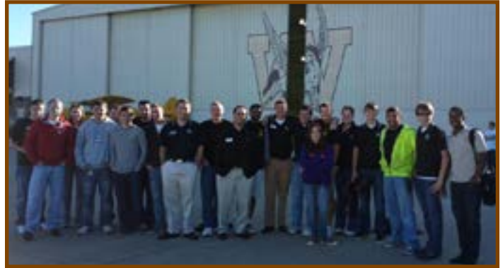
Great day for a chapter meet up with Eastern Michigan University at the pancake Fly-in!

On September 15, 2012, WMU students, faculty and staff, along with the community, enjoyed flying pancakes in the hangar at the College of Aviation. Over 250 guests were enthusiastically served by Chris Cakes. Guests also enjoyed the opportunity to visit with the 15 pilots who flew their aircraft into the college specifically for the event. One college Registered Student Organization, Alpha Eta Rho, also used the breakfast as an opportunity to meet the Eastern Michigan University chapter by inviting them to come to WMU to participate in the event. The timing of the event coincided conveniently with Governor Snyder's declaration that September 2012 is Michigan Aviation Month.