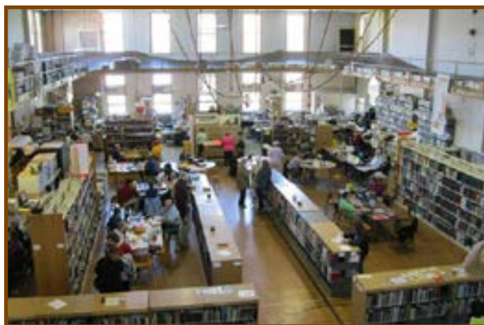
East Hall gym today, Archives and Regional History Collections, 2012

In conjunction with its annual meeting of members on May 14, the Friends of the University Libraries sponsored a program, "Salute to a Grand Old Lady," which included a history of the use of East Hall as the site of the WMU Archives and Regional History Collections, and North Hall, as storage space for the University Libraries. In 1990, the Archives and Regional History Collections moved from the lower level of Waldo Library to East Hall. The expanded quarters of East Hall provided room for the branch library to grow in collections and programming. The historic space also provided challenges in climate control and accessibility. About the same time, North Hall, Western's original library building, was put into use as storage for serials and lesser circulated monographs. The University's administration graciously consented to opening these buildings for a special tour sponsored by the Friends of the University Libraries. In addition to East and North Hall, the other two buildings on Western's original quad were opened to the tour. Over 50 people attended and