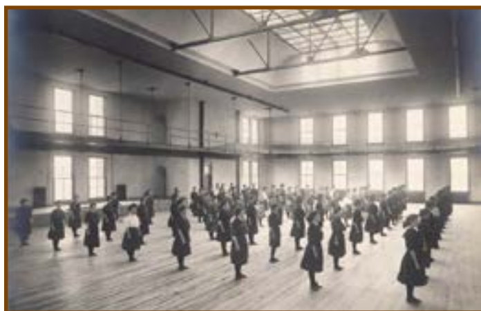
Women's physical education class in East Hall gym, East Campus, c. 1910