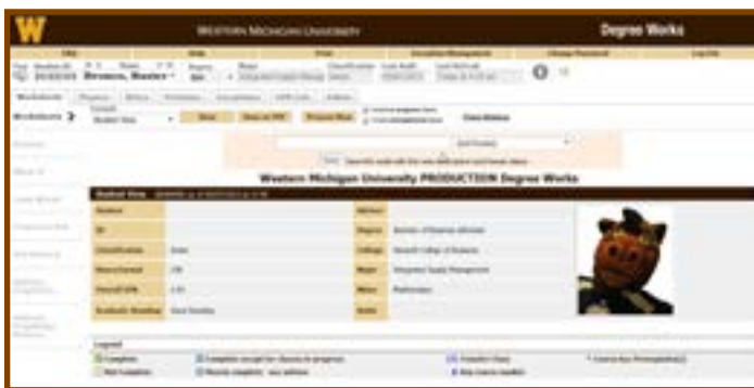
Degree Works System

When requirements are completed, they are checked off the list. In an effort to improve completion rates and reduce time to degree, the University made the commitment to purchase Degree Works. The Registrar's Office led the implementation, which began last May. With the help of a team comprised of representatives from several college advising offices and the Office of Information Technology, the first phase of the project is nearing completion. Western Michigan University students will soon have access to a tool that can help them better negotiate degree requirements and reach their academic goals. Using Degree Works, students will be less likely to take courses they don't need and more likely to stay on track for graduation. In addition to providing easy access to degree requirements, Degree Works offers a GPA advice calculator, as well as a "What If" option that allows students to see how changing their major will impact their progress toward degree completion. The next phase of the Degree Works project will include the implementation of additional features, including the planner that allows students and advisors to create a long-range academic plan containing a list of recommended courses for the student to take and the sequence and terms in which they are to be taken. Degree Works will be introduced to returning, undergraduate students during the fall semester. More information on Degree Works can be found on the Registrar's Office website at: www.wmich.edu/registrar .