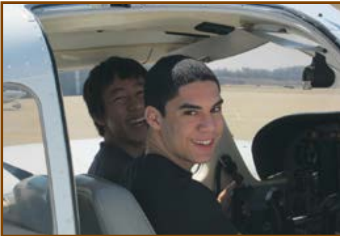
Track participants ready for takeoff!