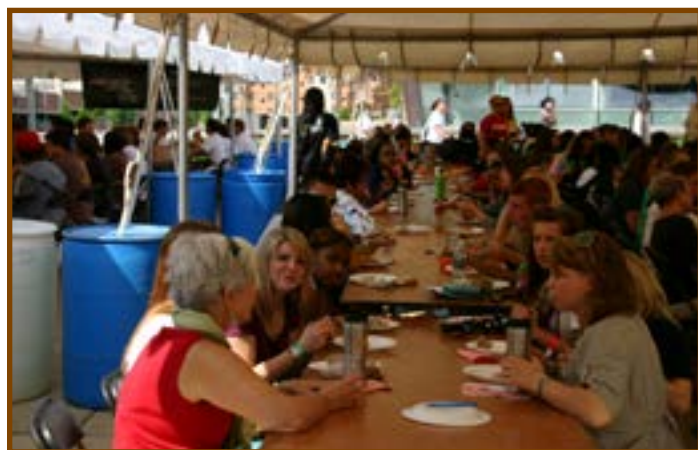
Fall Welcome Pizza with the Profs

Faculty and staff are encouraged to sign up to participate in Fall Welcome events. Fall Welcome is Aug. 27-30, 2013, with an early move-in day Aug. 26. The program helps first-year and new transfer students make a successful transition to WMU, both socially and academically. This year's welcome week will feature several new events, including: #discoverWMU, an on-campus scavenger hunt; Parent and Family Hospitality Tents on move-in days; Immerse Yourself, an afternoon to promote student engagement and will include the first Western Wednesday of the year, a t-shirt swap, an RSO Fair, Get Hooked engagement sessions, and Greek-a-Palooza, an on-campus event to showcase Greek