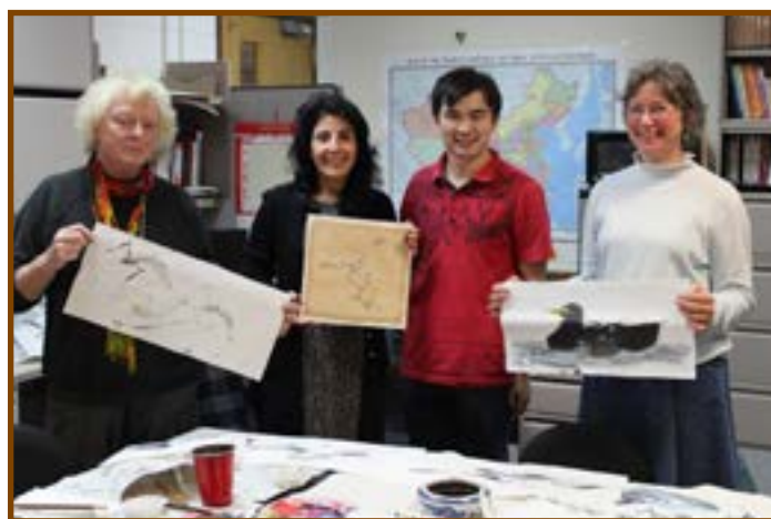
Participants in the water color painting culture class show off their work.

The Confucius Institute at WMU will host a wide variety of cultural activities and camps this summer: language camps for Chinese language students at Portage Public Schools; cultural activities for Portage Public Schools Chinese language students - China Summer Festival and a trip to Chicago's Chinatown for a