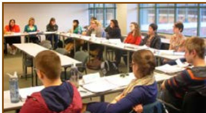
Student of the School of Public Affairs and Administration deliberating grant proposals