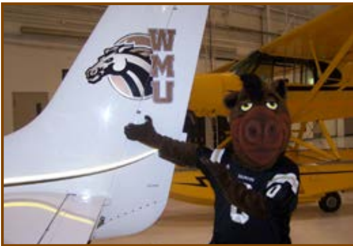
Buster loves the College of Aviation!

Two nationally recognized aviation organizations, Western Michigan University's College of Aviation and the Air Zoo, partner for a week of educational experiences, designed for kids ages 14-17. The summer camp includes enhancing leadership skills, piloting the advanced WMU Cirrus SR-20 and simulation devices, speakers from the industry, hands-on aircraft maintenance, and social activities. Beginning Sunday, June 23, students will enjoy a week full of science exploration during the WMU/Air Zoo's summer camp experience. Our professional educators will share the thrill of aviation and space with campers through hands-on activities and interactive experiments. Campers will get an in-depth look at WMU's College of Aviation and the Air Zoo, including the 4D theater, full-motion flight simulators and much more! This camp includes five nights of accommodations in the WMU residence halls; all meals and snacks; entrance fees into all activities and parks; linen packet; ground transportation to all activities and events (no vehicle required); all flight and simulator fees; and instructional time. Cost is $1,250 for the week. To register for this camp, visit www.wmich.edu/aviation or call (269) 964-7846. Please note students in this camp will not receive an Air Zoo T-shirt, pizza party, or 10% discount.