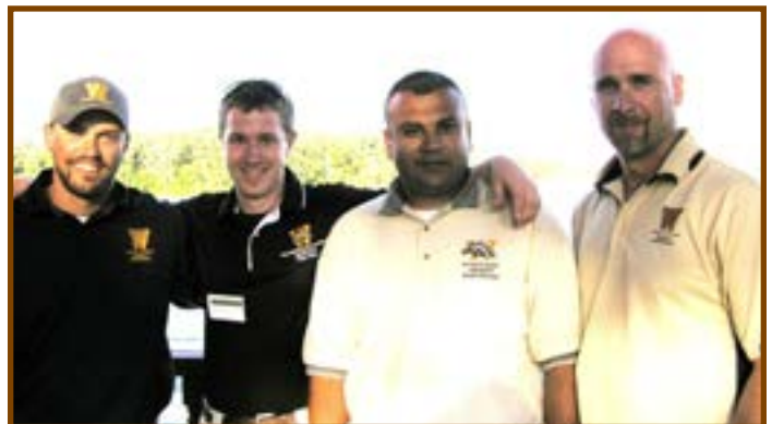
Staff and students golfing together