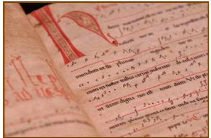
A new Dublin Core application profile is presented for medieval manuscripts such as this one