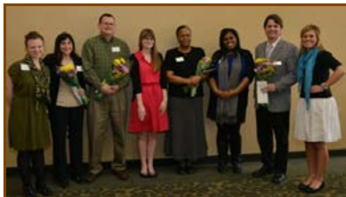
Students of the School of Public Affairs and Administration present funding to four Kalamazoo nonprofit organizations totaling more than $14,000

because they saw great potential in all of them. This year's seminar awarded grants to Big Brothers/Big Sisters, Community Homeworks, Crescendo Academy of Music, and the Irving S. Gilmore International Keyboard Festival. For more details and photos, please visit www.wmich.edu/arts-sciences/news2013-5-lnp .