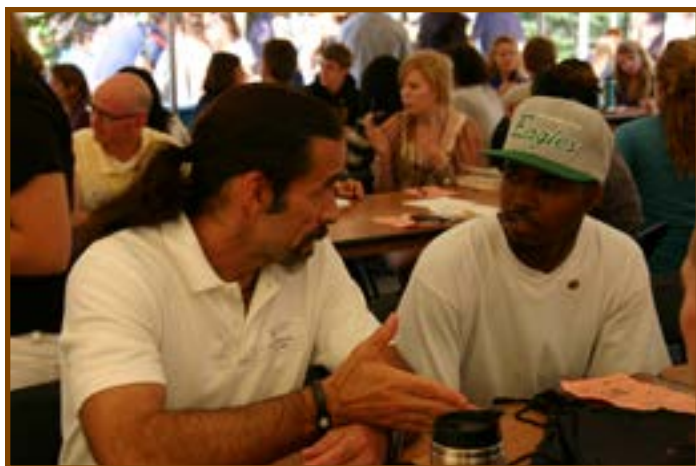
Fall Welcome Pizza with the Profs