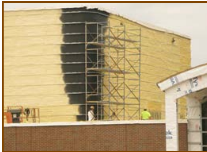
Legacy Collections will be energy efficient with special construction design

Progress toward completion is especially visible daily now at the new home for the Archives and Regional History Collections as evidenced by the photos from early May. The large bay section is being insulated with many layers of insulation to be energy efficient for the climate controlled storage of historical materials (see the photo with scaffolding). The horizontal strips are where the siding will be attached in the next step. The second photo shows the front window wall that was installed at the main entry the week of May 12. A new website is now available for construction photo updates, project information, and links to donate to Phase II--the "Athenaeum or Loud-space": wmich.edu/library/legacy . Alumni and Community support are graciously welcome for this lecture and workshop space for the campus and greater Kalamazoo area.