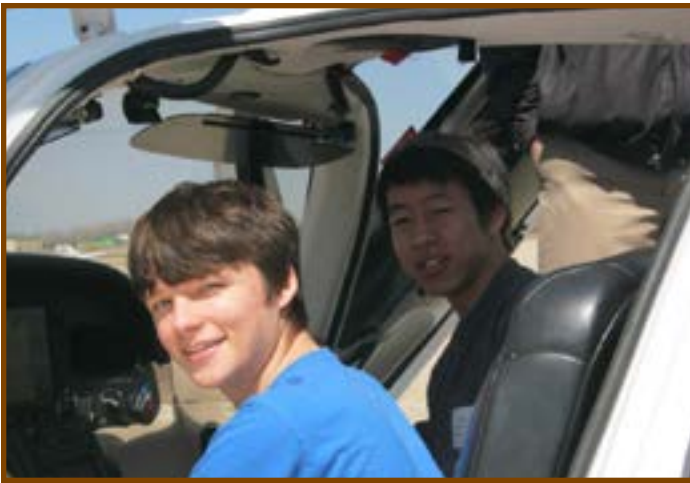
Track participants enjoying their visit.