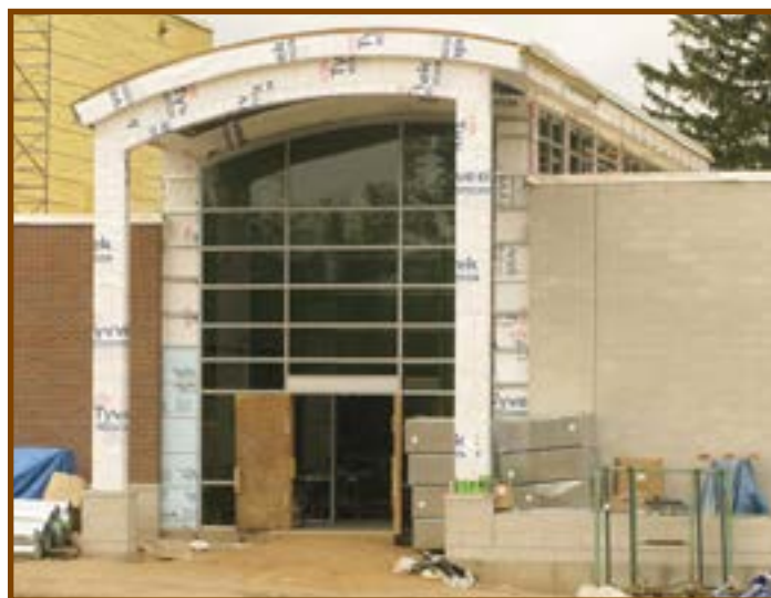
Front window-wall is newly installed