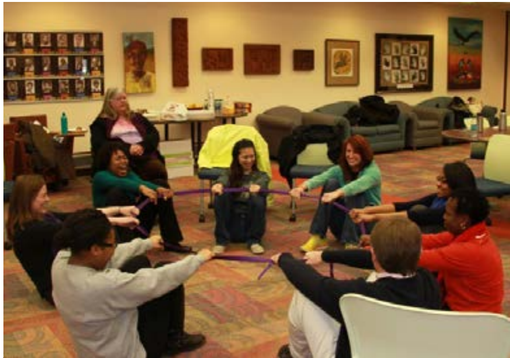
Staycation group working through a daily activity