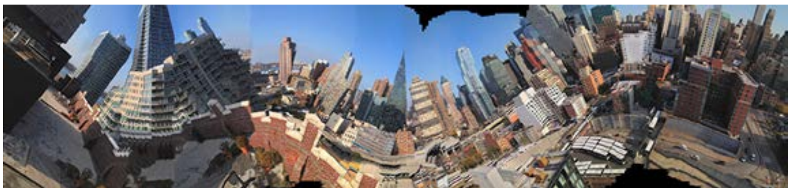
Roiled City by Paul Solomon