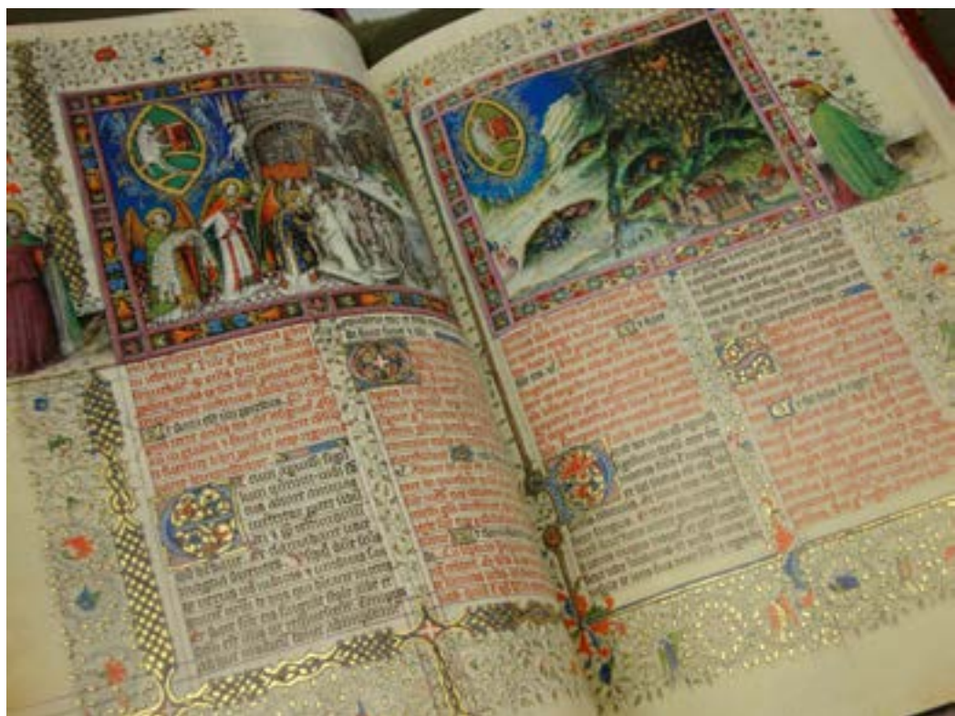
Illustrated manuscript facsimile from Waldo Library Special Collections and Rare Books Room

A visiting exhibit by WMU Libraries Rare Books and Special Collections of medieval manuscript facsimiles was held on Valentine's Day for the Society for Creative Anachronism. These high-