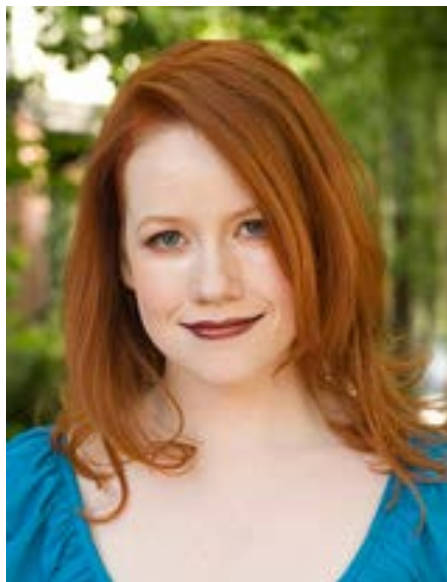
Richelle Mead ('01)

selected the 2013 Alumni Achievement Award winner for the Department of Comparative Religion.