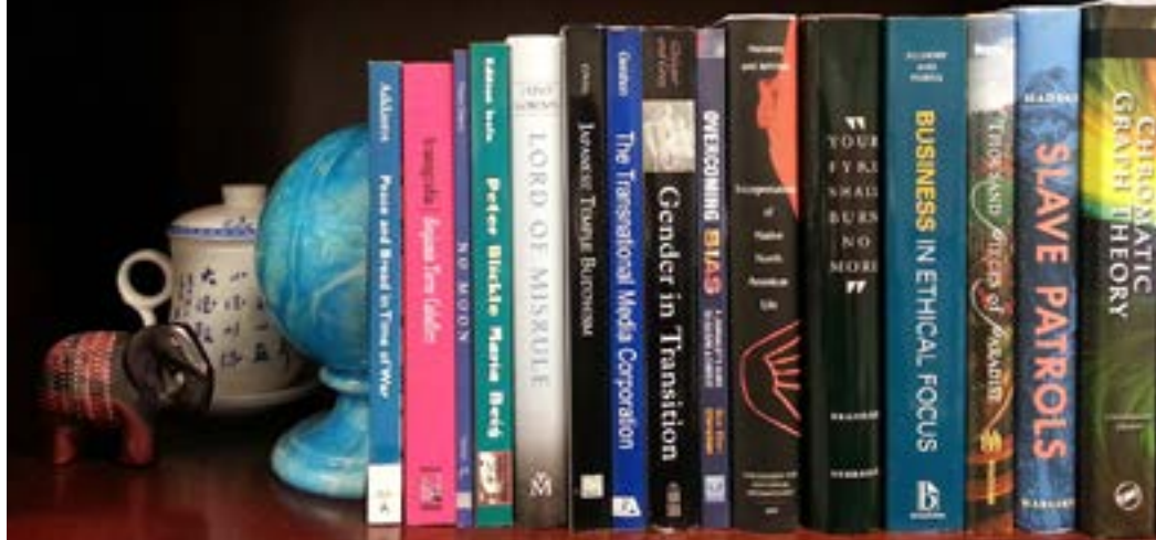
Liberal Arts dialogues taking place in person and online