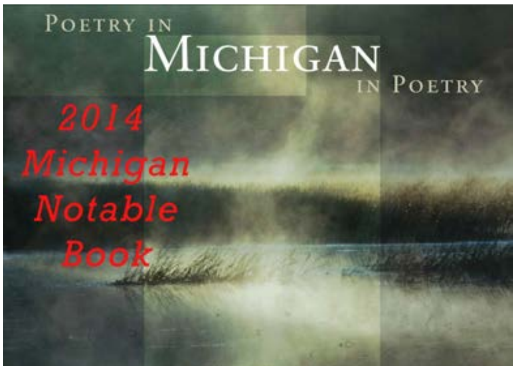
News Issues Poetry and Prose's anthology, "Poetry in Michigan/Michigan in Poetry"

SURVEY: CLICK HERE TO TELL US WHAT YOU THINK ABOUT PRISM.