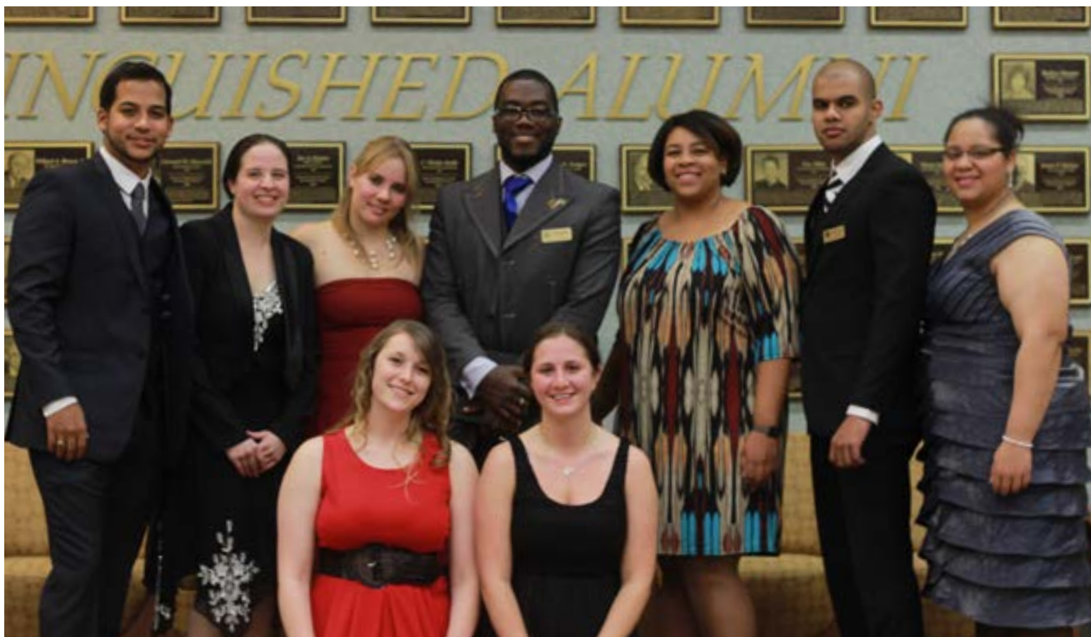
Graduate Student Advisory Committee Executive Board Members