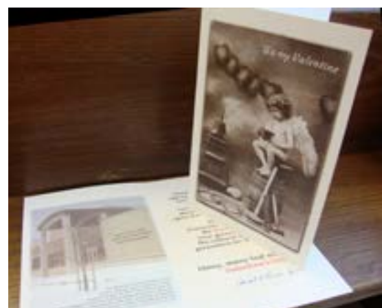
Valentine highlights the unique holding of Archives and Regional History Collections