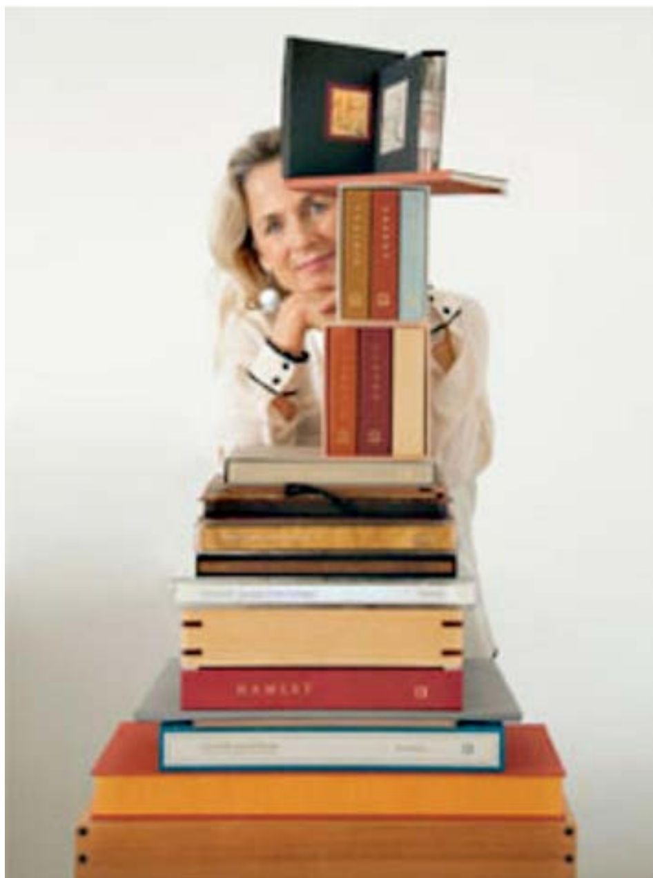
Heebner lecture supported by Friends of University Libraries