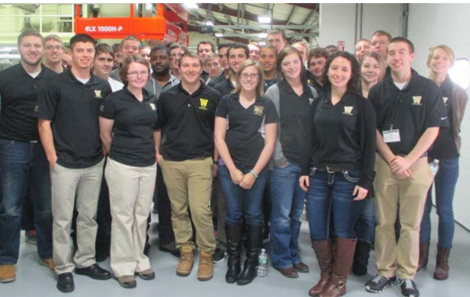
WMU student group at the SAM Pilot Coating Facility