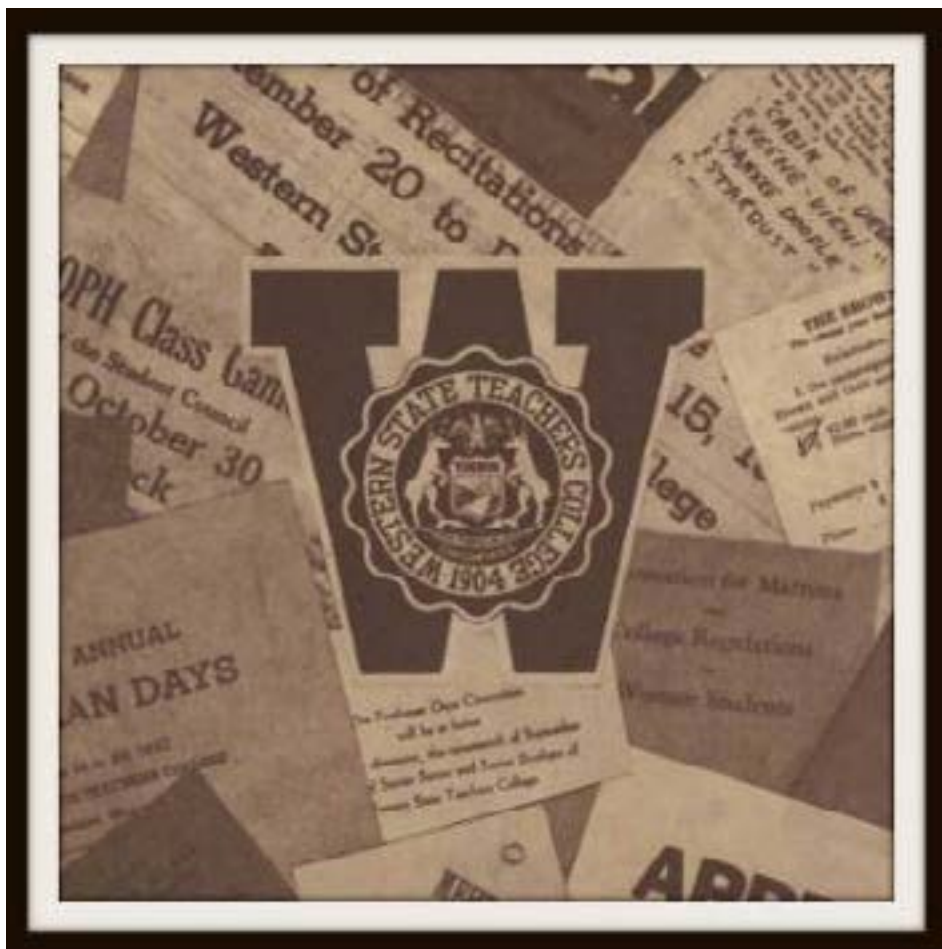
1938 image used for Throwback Thursday on MyWMU Facebook page