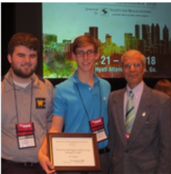
Industrial engineering team takes 2nd place in national conference