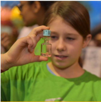
Students team up with youth at engineering competition for girls