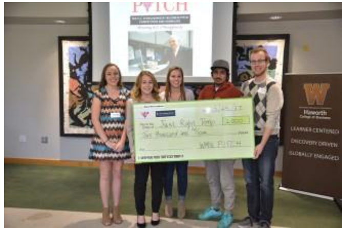
Just Right Temp winning team