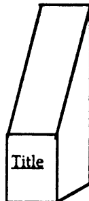
Front View of Cereal Box