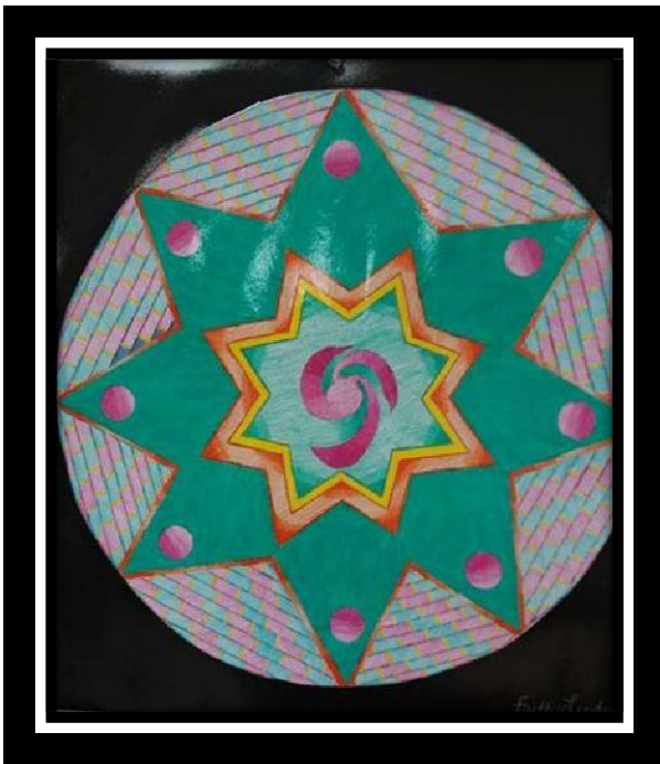
Figure 7. Zentangle Mandala with Color by 7 th grade student.