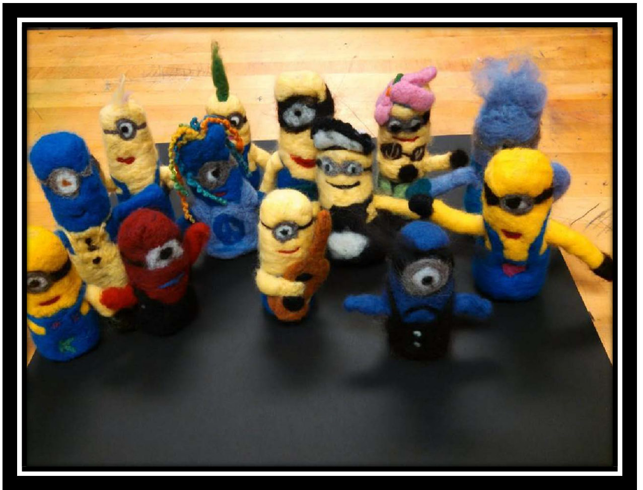
Figure 9. Needle Felting by 7 th grade students.

YouTube is a great place to find “how to” videos on needle felting, handouts of minions, handouts of movie reviews