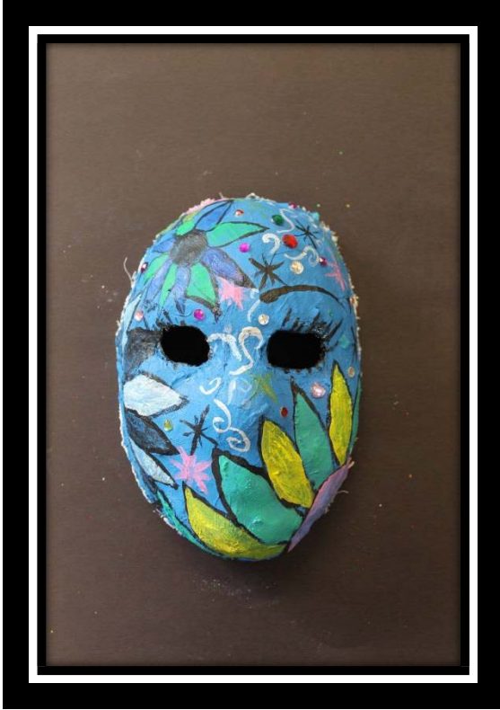
Figure 11. Plaster Mask with Gems and Flowers by 7 th grade student.