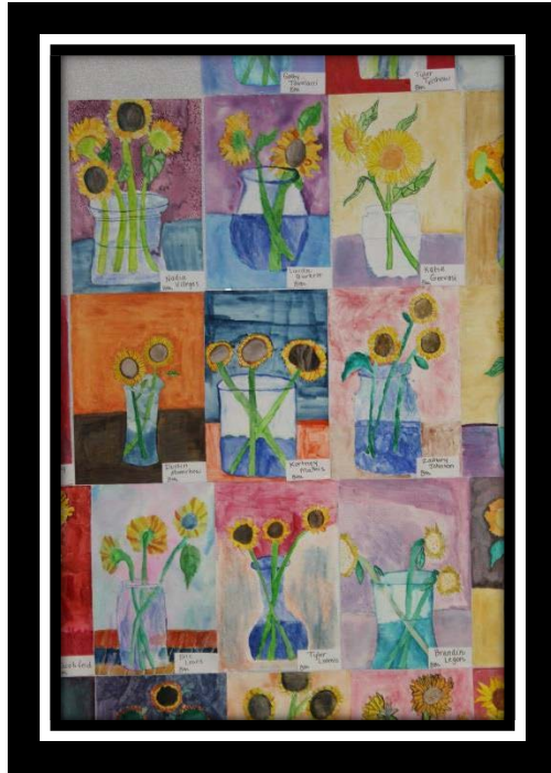
Figure 1. Sunflower paintings by 7 th and 8 th grade students.