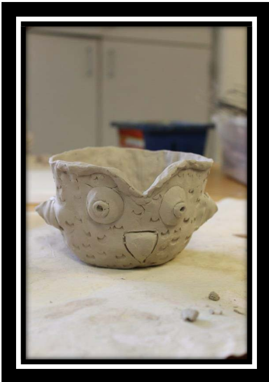
Figure 4. Owl Vessel by 7 th grade student.