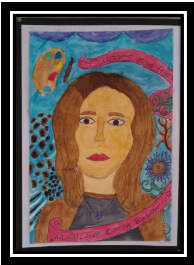
Figure 3. A Self Portrait by 7 th grade student.