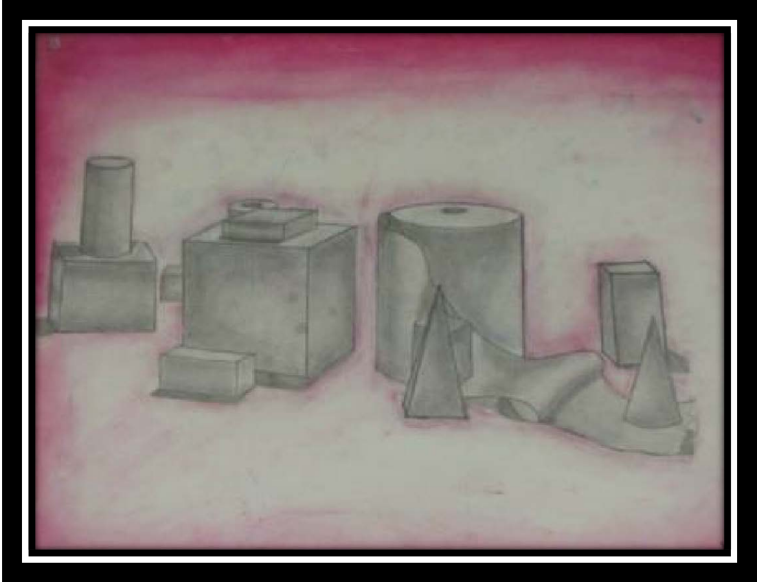
Figure 2. Object drawing by 7 th grade student.