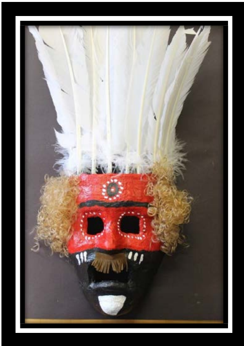
Figure 10. Plaster Mask with White Feathers by 7 th grade student.