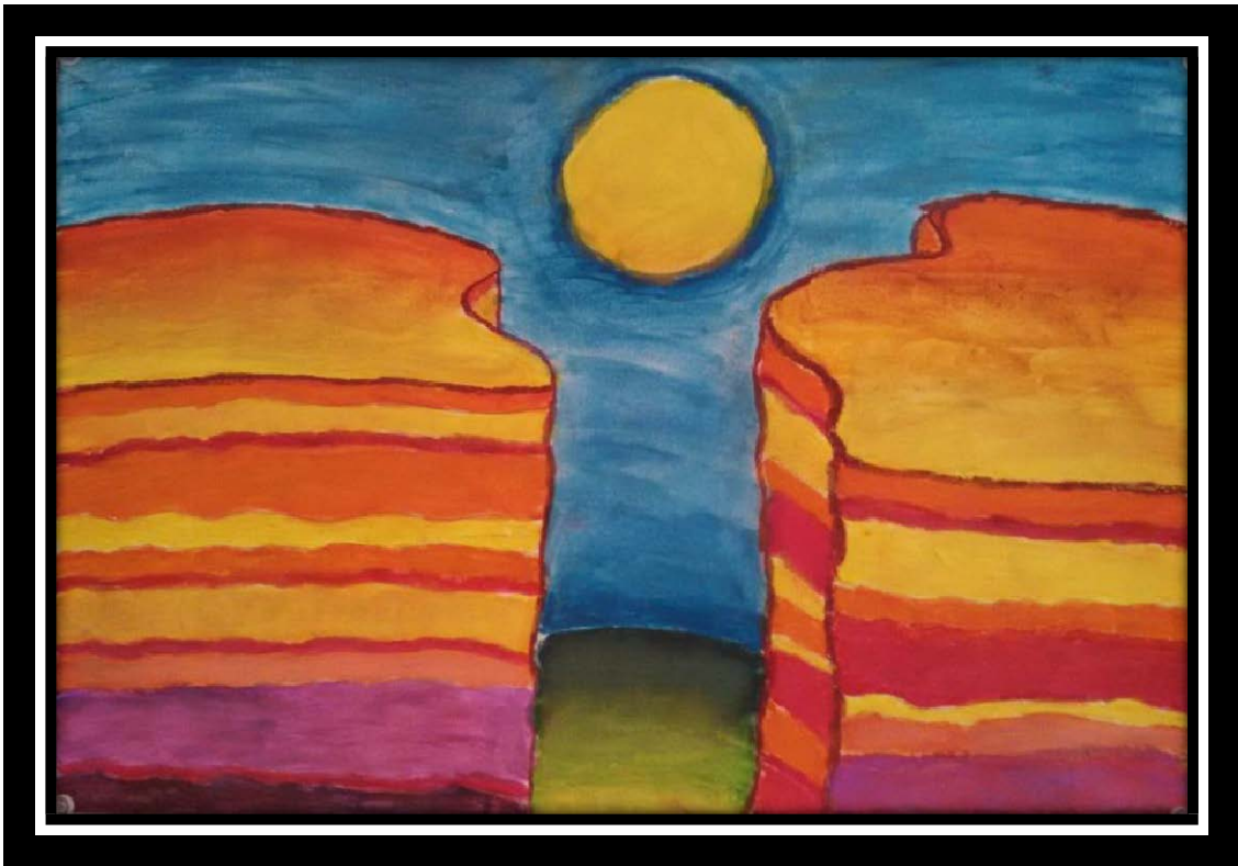
Figure 8. Chalk Pastel Landscape by 7 th grade student.

Slides of Ted Harrison's work, printouts to put on desks of various landscapes (old calendars work great for this), an assortment of haiku poems.