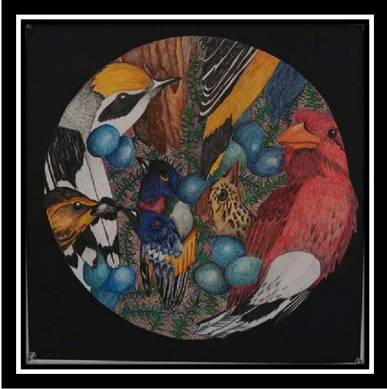
Figure 6. Bird Mandala by Author.