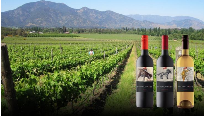
Bottles of Bronconess wine.