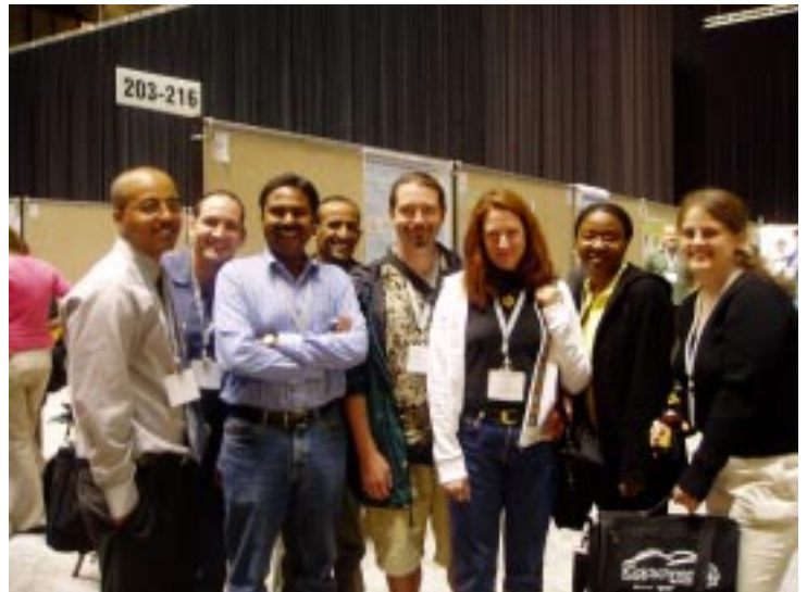
Some faculty and students at the 15th Annual Goldschmidt Conference, Moscow, ID