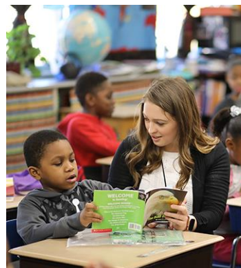
WMU enrollment is up in teacher preparation programs