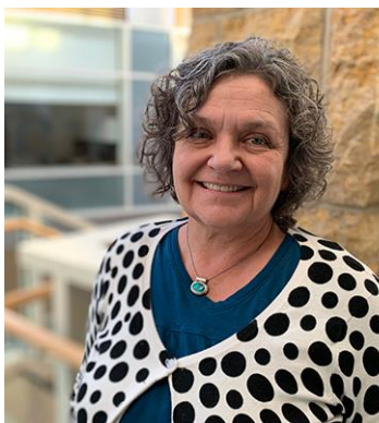
Staffer accomplishes her college goal