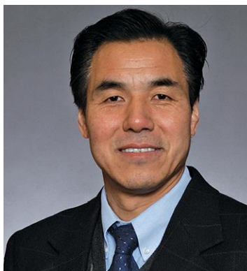
Professor named AAAS fellow for watershed hydrology work