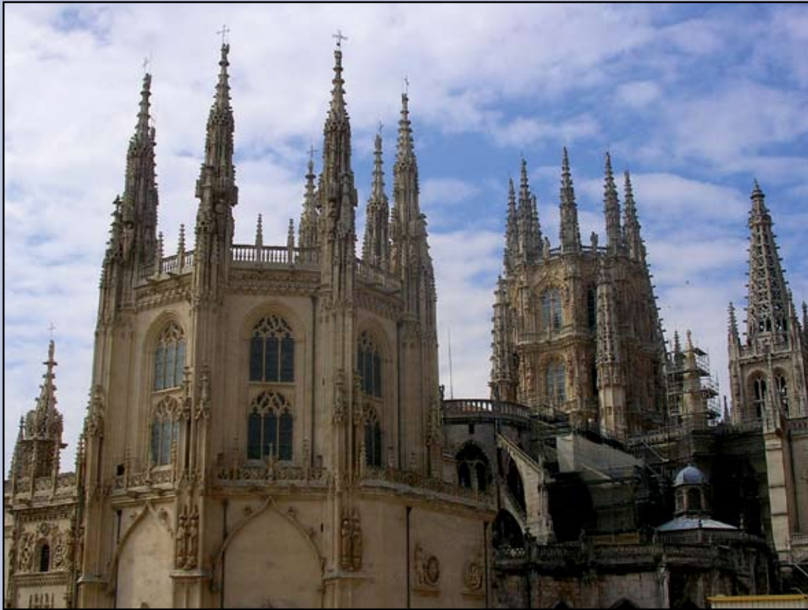
La catedral de Burgos.

morning and workshops in the afternoon, in addition to several field trips conducted by a young art instructor. Everyone enjoyed these classes, so they tell me, and I know that they made considerable progress with their Spanish. At the conclusion of this part of the academic program students had a week of vacation, which they used to travel in Spain and beyond.