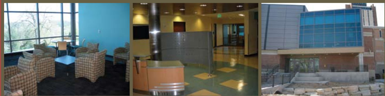
Sneak peek at some of the School's new spaces in Brown Hall...watch for more coverage in our next "communicator."