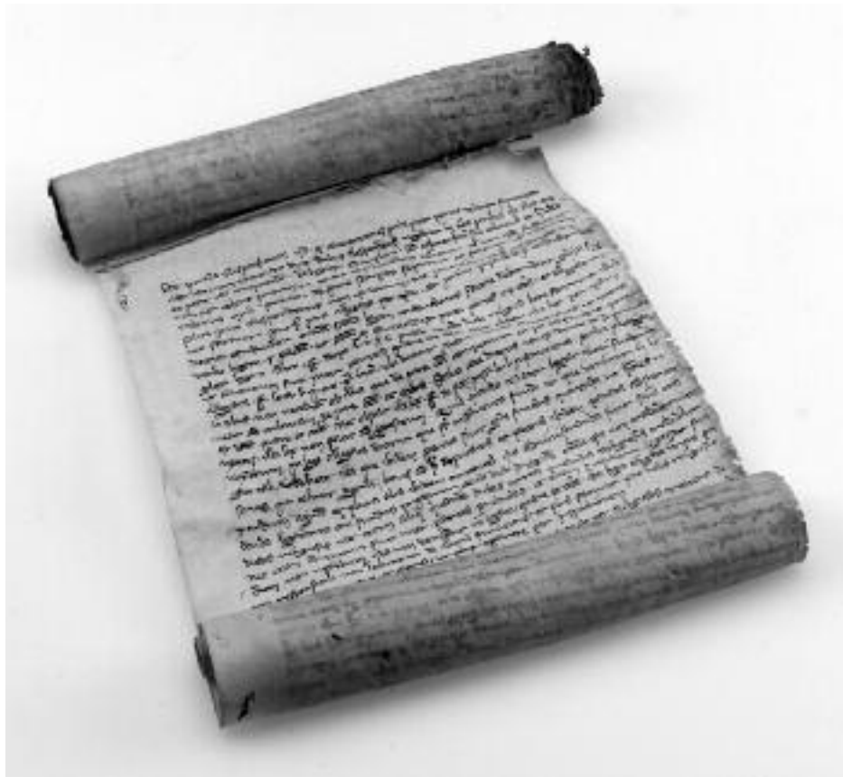
Ms. 142, Western Michigan University Manuscript Collection, Waldo Library, Western Michigan University, Kalamazoo, MI 49008.

This manuscript, held by Western Michigan University's Rare Book and Special Collections Department in Waldo Library, documents a legal opinion in the dispute between the Cistercian abbey of Cambron and the college of canons regular of Collégiale Saint-Vincent de Soignies. The canons accused the Cistercian monks of illegally occupying land in Sars Moullet. The scroll is a new acquisition in the Library's extensive collection of primary and secondary materials that support the research and instruction of the Medieval Institute and the Institute of Cistercian Studies at Western Michigan University.