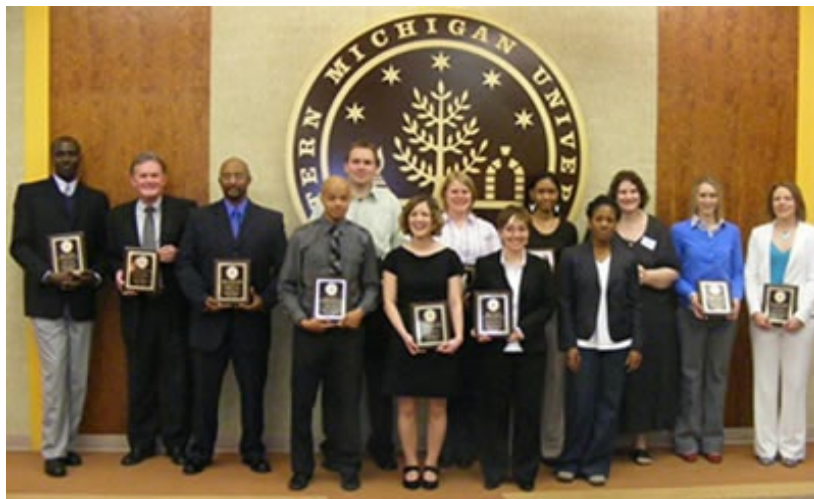
Recipients of the Counselor Education and Counseling Psychology Awards

Congratulations to our 2009 award recipients!