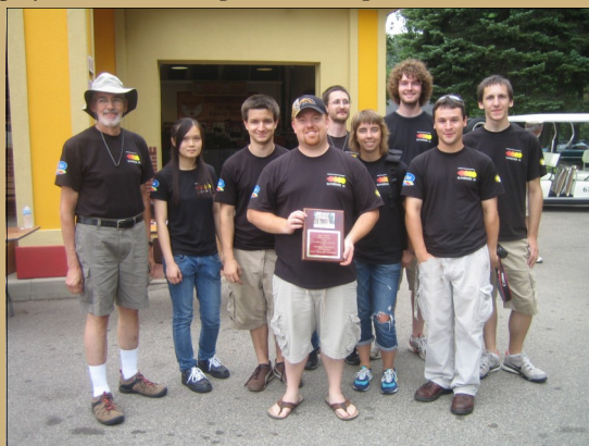
The Sunseeker crew after receiving their award.

This event is considered one the biggest featuring antique, classic and special interest cars, with a swap meet and a car corral. Hundreds of cars were displayed and it was a great showing for the Sunseeker.