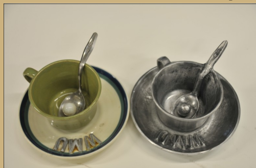
Handmade cast using green sand without cores.