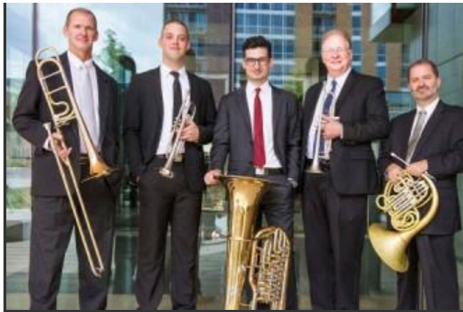
Wisconsin Brass Quintet

KALAMAZOO, Mich.—The Wisconsin Brass Quintet will perform at 5 p.m. Thursday, Oct. 19 , in Western Michigan University’s Dalton Center Recital Hall. The event is free and open to the public.