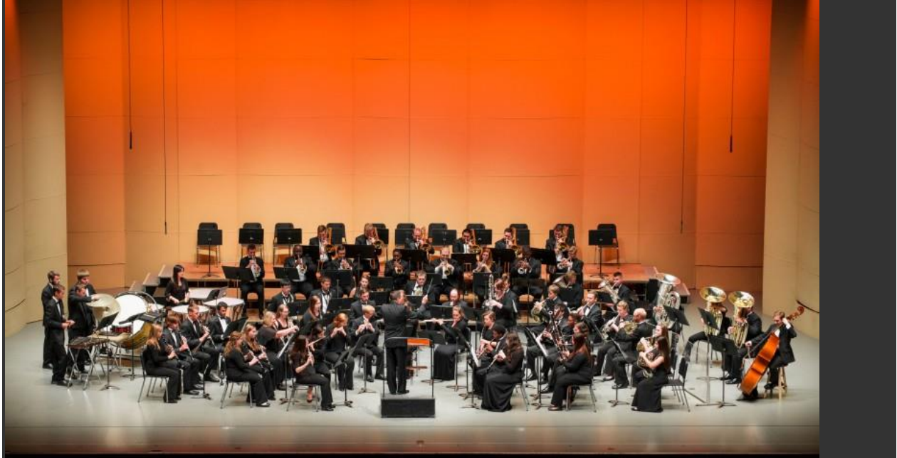
University Symphonic Band