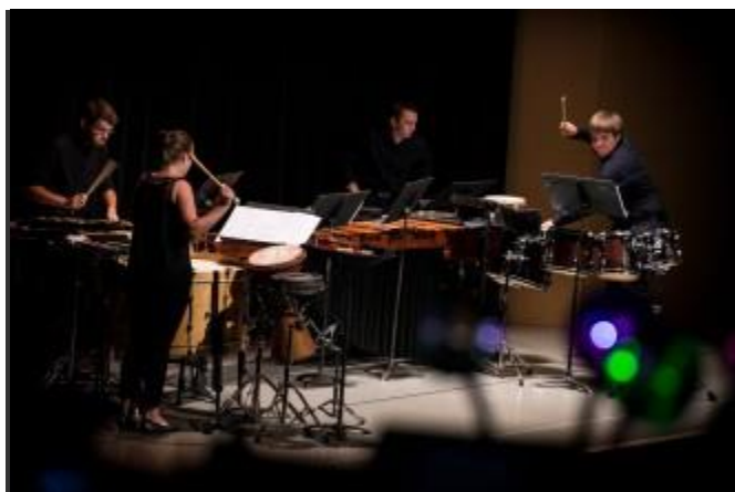
Members of the University Percussion Ensemble