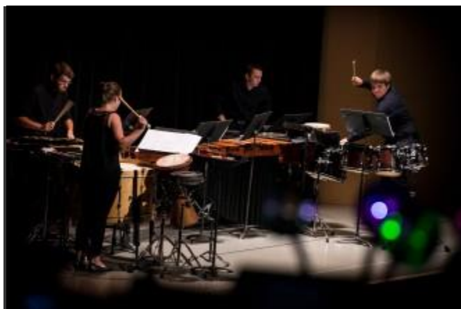
Members of the University Percussion Ensemble