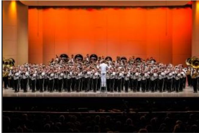
Bronco Marching Band