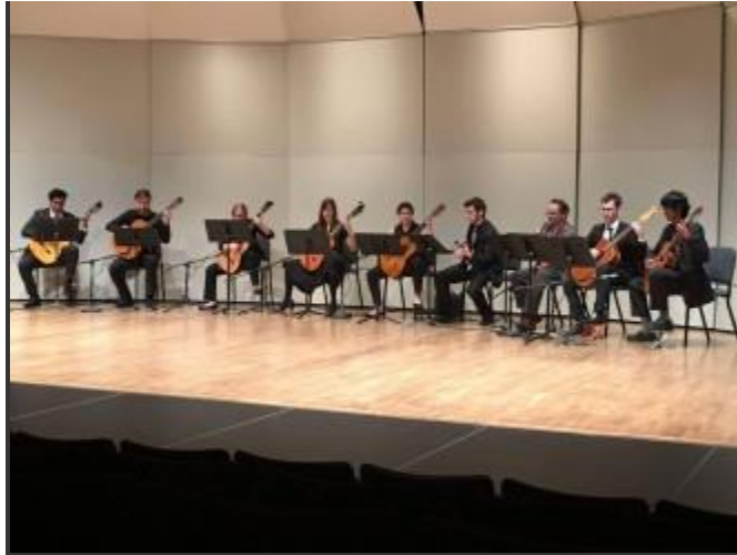
Oakland University Guitar Ensemble

KALAMAZOO, Mich.—Guest artists from the Oakland University Guitar Ensemble will perform at 8 p.m. Friday, Oct. 20 , in Western Michigan University’s Dalton Center Recital Hall. The recital is free and open to the public.