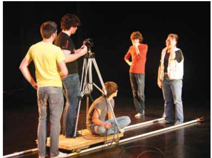
Film, Video, and Media Studies students shoot video for "Romance sans Parole"