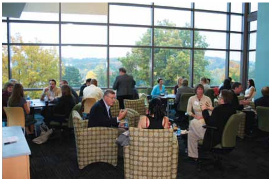
Students and alumni gather in the Clifford Center of Brown Hall for lunch during Homecoming week.

Each year during homecoming week the members of our External Advisory Board travel to campus for an annual meeting. Last year, as part of that meeting, the School of Communication hosted an informal luncheon which gave the board members the opportunity to interact with some of the School's top scholars.