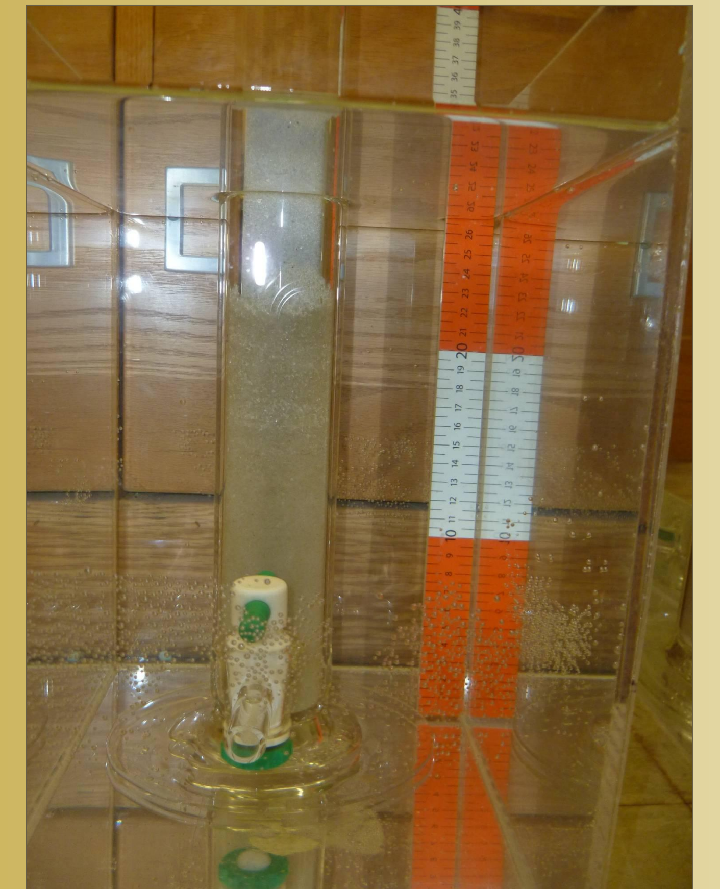
Fig. 5: measuring capillary depression