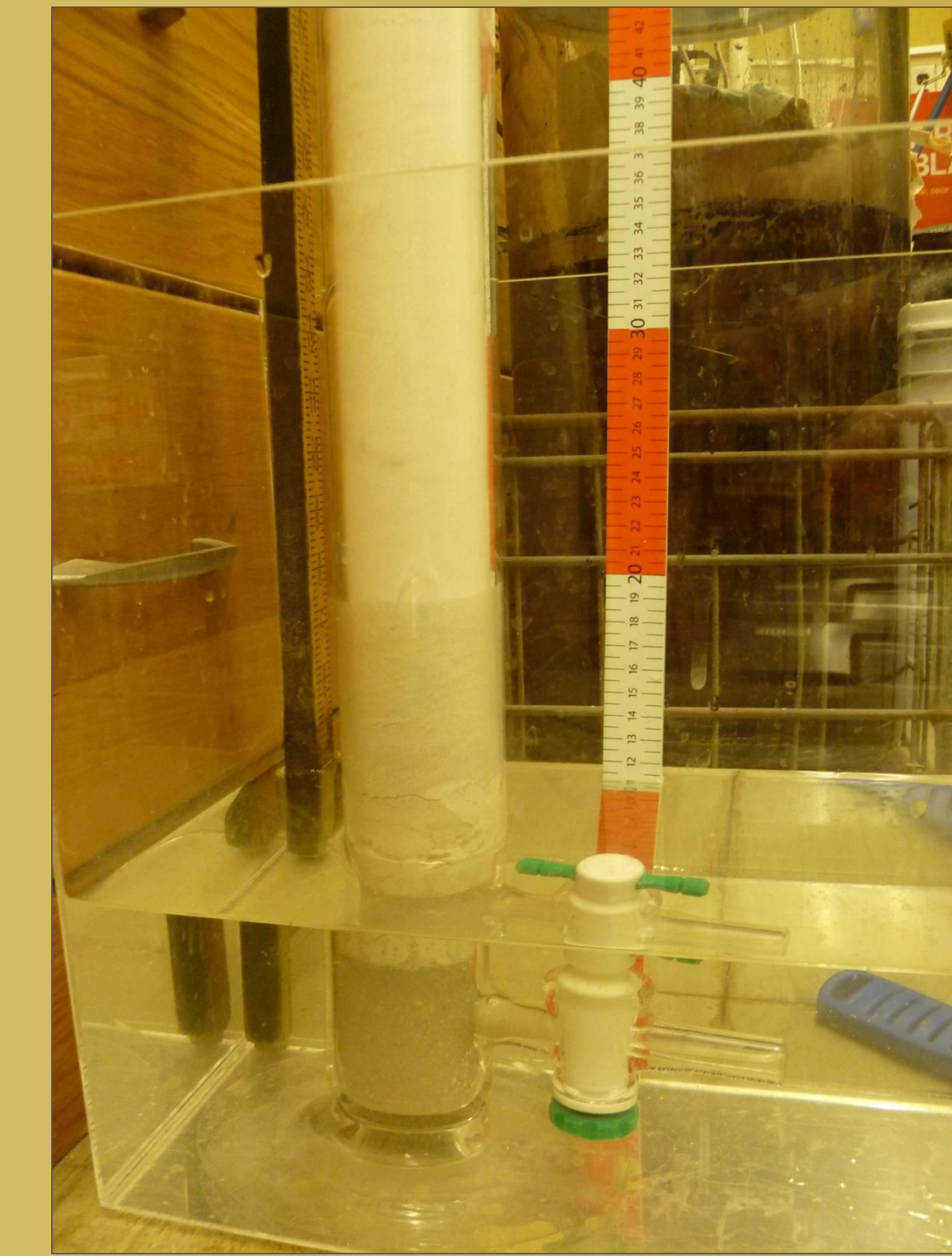
Fig. 4: measuring capillary rise