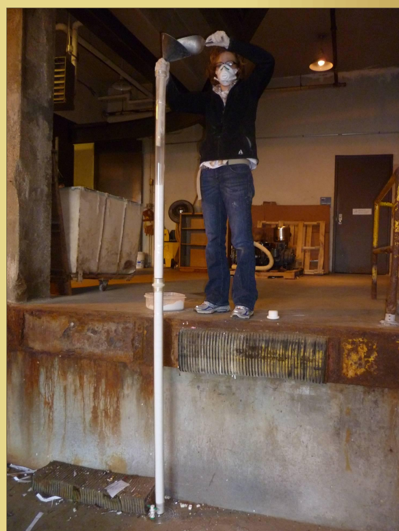
Fig. 1: Packing silt column