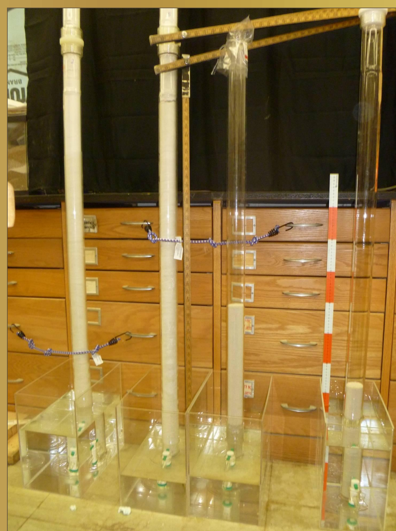
Fig. 2: silt and sand columns