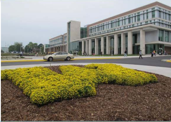
The "New" Sangren Hall