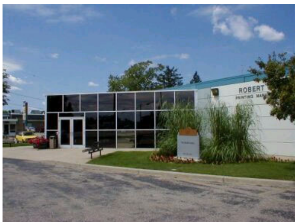
Research Center , continued on page 6