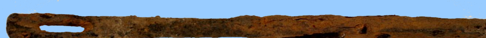
Needles and thimbles from Fort St. Joseph