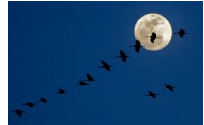
Cranes with Full Moon

The exhibit is currently on display in the second floor art gallery of the College of Health and Human Services. The exhibit is open during normal building hours - Monday through Thursday, 8 a.m. to 9 p.m., and 8 a.m. to 5 p.m. on Friday and Saturday.