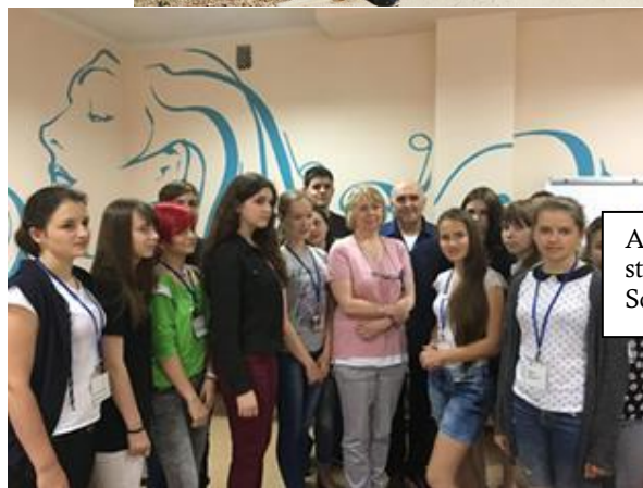
After the lecture in Kyiv, with students of the Little Academy of Sciences, June 2017