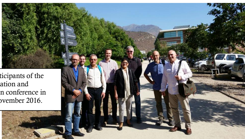
With participants of the Secularization and Toleration conference in Chile, November 2016.

Session organizer of "Secularizations and counter-secularizations: Theoretical and Comparative Perspectives" at the Conference of the International Society for the Sociology of Religion (ISSR), University of Lausanne, Switzerland, July 2017.