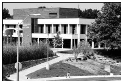
New landscaping makes walking up the Gilkison Avenue hill by Sindecuse a little less daunting.

• Improvements on either side of the south end of Gilkison Avenue were completed this summer. On the west side, new plantings and a retaining wall have spruced up the hillside by the Sindecuse Health Center. To