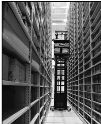
This elevator-like forklift is used to position archives materials in the Zhang Center's three-story storage vault.

The library closed Aug. 1 in East Hall and will finish moving into the newly constructed Zhang Center Friday, Sept. 27. It will begin providing full services again in mid-October.