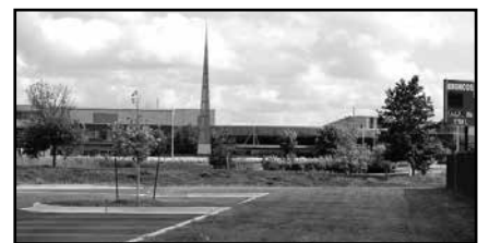
Soccer fans now have paved parking and a view of the engineering campus.

The stadium's field surface now sports the innovative FieldTurf Revolution CoolPlay system and features FieldTurf's exclusive cork