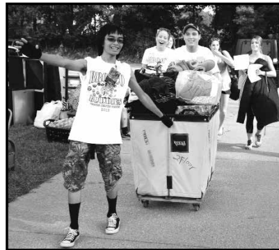
Volunteer Bronco Buddies who help classmates move into their rooms each fall are a long-standing feature of the existing residence hall community.

• Center Neighborhood will be made up of a residence hall built for fall 2015 occupancy where Bigelow and Hoekje halls now stand. It also includes nearby Henry Hall and the Hoekje/Bigelow dining room that is in the Bernhard Center.