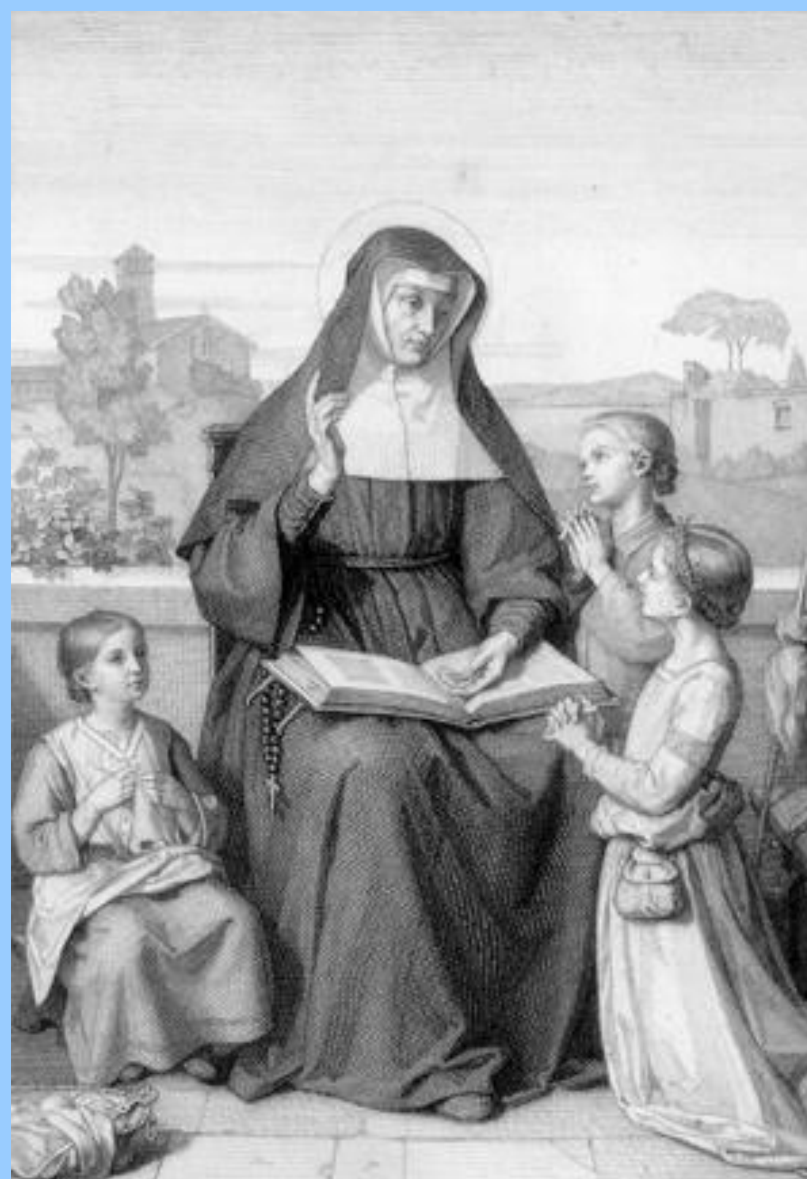
Artist's conception of a nun teaching girls

"The Sisters will only take girls between the ages of eleven and twelve, in order to make them able to receive communion within the first year, after which, they can be dismissed to make room for others. Those who remain in school longer are to learn the basics, then to acquire manual skills: sewing, spinning, knitting and even fine embroidery" ~ Monseigneur de Saint-Vallier, 1689