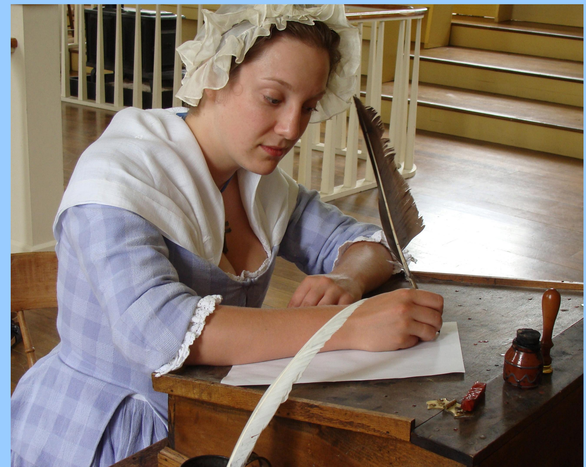
Re-enactor writing with a goose quill

Literacy rates in New France were quite low, but some Canadians came to possess substantial libraries including those living at Detroit and Michilimackinac. Written communications connected Fort St. Joseph residents with the outside world. Military orders, fur trade business letters, and the priests' baptismal register required writing skills. Very few people at the fort could sign their names, let alone write letters. The exceptions were the commandants who produced, as far as we know, only business related correspondence.