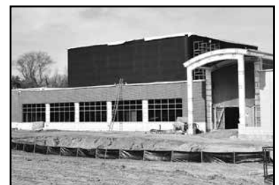
Zhang Center construction site

A construction sign will soon go up on East Campus that features an artist rendering of what East Hall could look like when the alumni center opens in 2015.