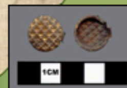
Basket Weave Button