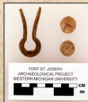
Mouth Harp and Gaming Pieces