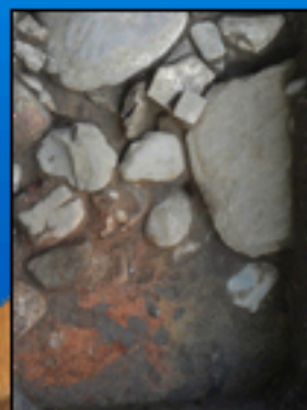
Feature 20: Fireplace