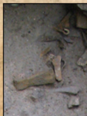
Axe in the Feature 19 Metal Cache