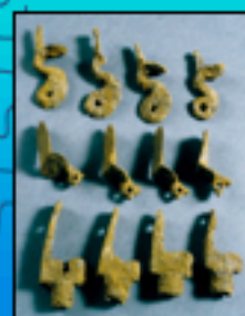
Flintlock hardware from the gunsmith's cache

Top Row: Gun cocks Center Row: Frizzenes Bottom Row: Breech Plugs