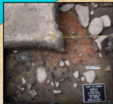
Feature 10: Fireplace

Top Row: Gun cocks Center Row: Frizzenes Bottom Row: Breech Plugs