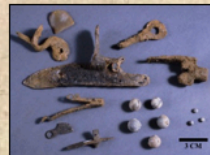
Flintlock Hardware and Munitions