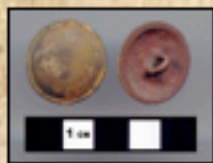
French Marine Button