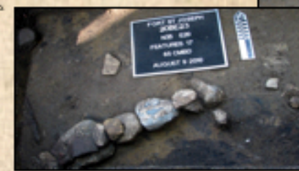
Features 17 and 18: Foundation Wall and Wooden Posts