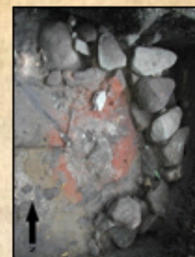
Feature 2: Fireplace