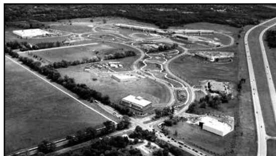
Aerial view of the BTR Park

"This development, along with the upcoming construction of a new corporate headquarters for the design firm mophie, means