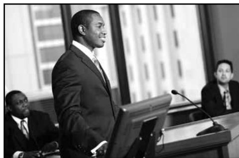
Founded in 1972, Cooley is the nation's largest law school.