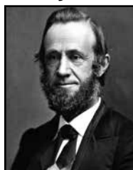
Thomas M. Cooley

Cooley was elected in 1864 to the Michigan Supreme Court, where he served as the leading justice for 20 years, and in 1887, President Grover Cleveland nominated him to a seat on the new federal Interstate Commerce Commission, where he emerged as the dominant commissioner.