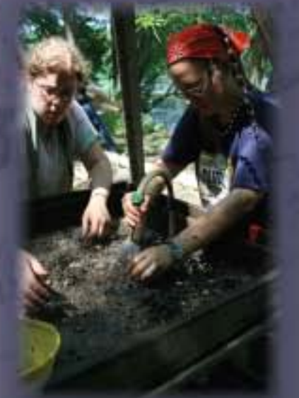
Field school students wet screen dirt to find artifacts.