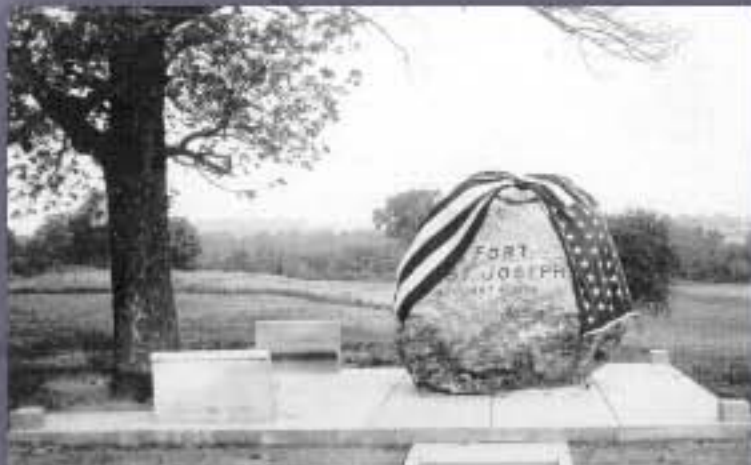
Fort St. Joseph has long been remembered and commemorated in the Niles community.