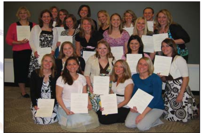
Speech Pathology and Audiology students with their oaths.