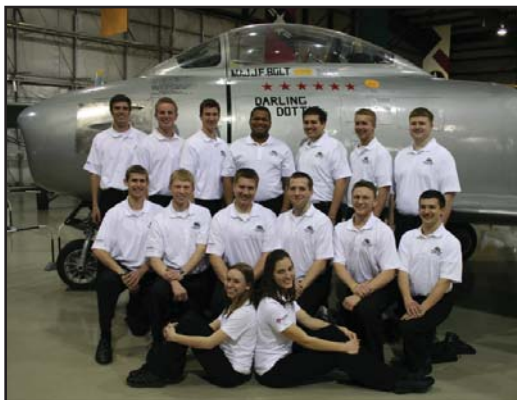
Sky Broncos extend top-four streak in national competition.