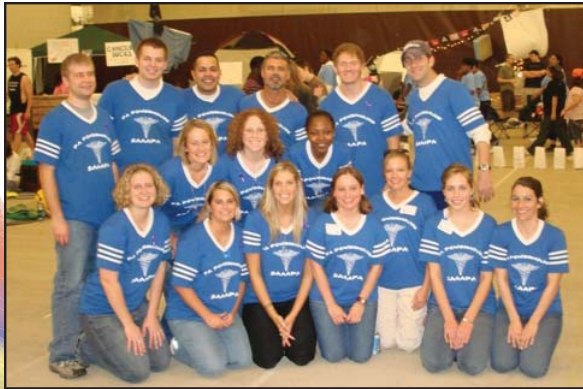
Team PA Powerhouse, participants in the Relay for Life.

both first-year students in the Physician Assistant Program, served as the co-captains for Team PA Powerhouse. They coordinated several Relay for Life events including fund raising nights at BD's Mongolian Barbeque, where team members served meals and held a silent auction, and the Grotto, where part of the proceeds from drink specials were donated to the team. Congratulations to Team PA Powerhouse, and thanks to Kohl's Department Store for a generous financial contribution and stuffed animals for participating children, and to Sav-A-Lot for bottled water and snacks for the team.