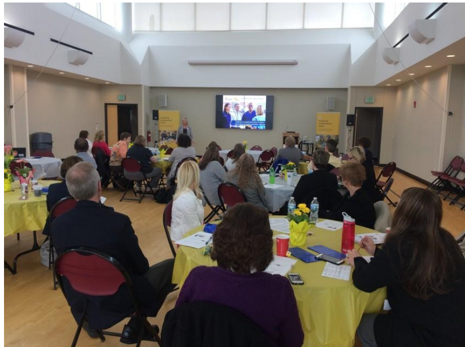
SUN Conference attendees at the College of Health and Human Services

Congratulations to the CHHS Simulation Committee on their leadership in this growing area in health care education.