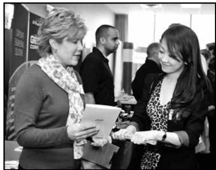
The 2012 Career Fair

On one front, another record year may be in the offing for the annual Career Fair, which is set for 10 a.m. to 3 p.m. Thursday, Feb. 14, in the Bernhard Center Ballroom.