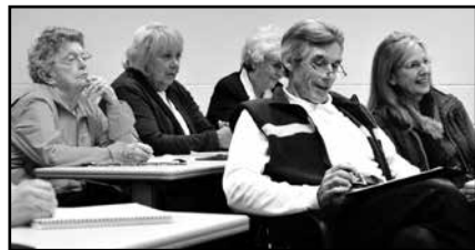
Lifelong learning class

There's still time to register for many of the Lifelong Learning Academy's spring offerings, including classes on such diverse subjects as seafaring, early Jesus movements,