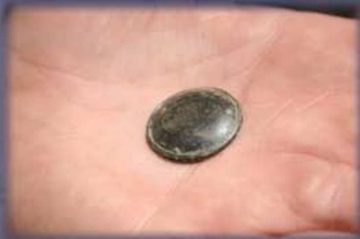
A French Marine button uncovered at Fort St. Joseph, indicating the French military presence at the fort.

The military presence at the fort normally consisted of a commandant and 8 to 10 enlisted men. Several French Marine uniform buttons have been uncovered during archaeological excavations as well as an entire cache of gun parts (part of a gunsmith's repair kit), some of which likely belonged to flintlocks of military issue. These items give tangible evidence of the soldiers, beyond the official documents that recorded their presence at Fort St. Joseph. British soldiers occupied the fort from 1761 until Pontiac's Rebellion in 1763 when supporters of the Ottawa leader attacked and occupied Fort St. Joseph in order to force the British from the area and encourage the return of the French. The fort was not regarrisoned by the British after this episode until a brief occupation in 1779. Material evidence of the British military consists of a ramrod