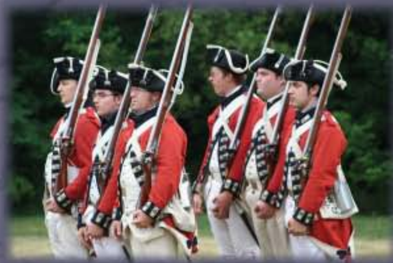
Re-enactors depict the King's 8th, a British regiment stationed at Fort St. Joseph.

carried out their daily duties, what they wore, what they ate, and what they might have done for leisure. But it is already certain that the soldiers at the post on the St. Joseph River carried out the important duty of securing the western Great Lakes region for trade which was so important in colonial North America.