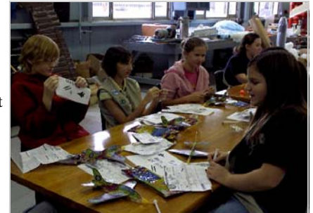
Girl Scouts from the Glowing Embers Council build paper and foam planes at the SWE "Engineer for a Day" workshop.