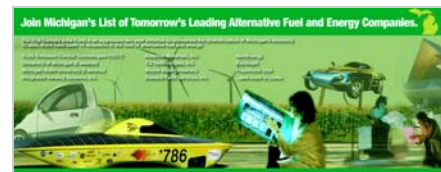
The mural displayed at this month's North American Auto Show in Detroit with its image of WMU's Sunseeker '05.