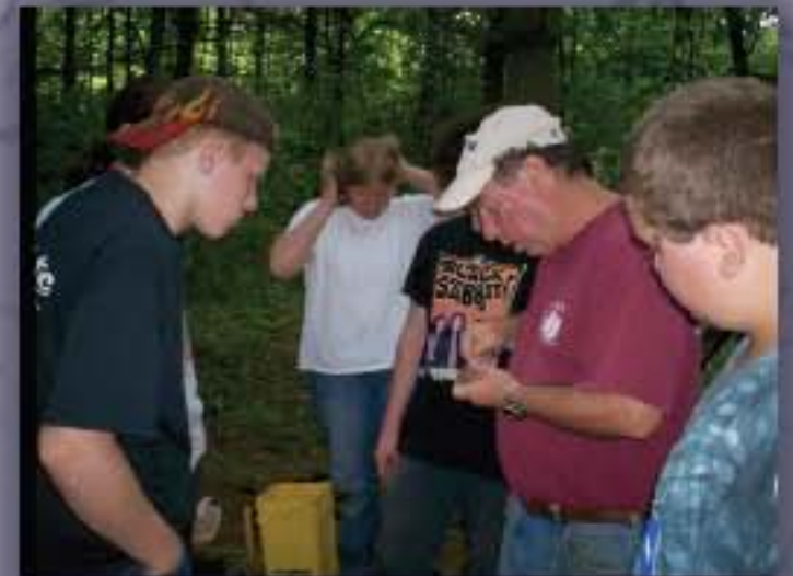
Summer campers excavate alongside project archaeologists.

along with project archaeologists. Members of the project also work to spread knowledge of Fort St. Joseph. Project archaeologists present fort history and our public archaeology program at various conferences. Recently, presentations were given at Williamsburg, St. Louis, Albuquerque, Québec, Vancouver, Puerto Rico and La Rochelle, France, as well as throughout Michigan and the Midwest. Integrating community service learning into the field school makes Fort St. Joseph archaeology a unique project.