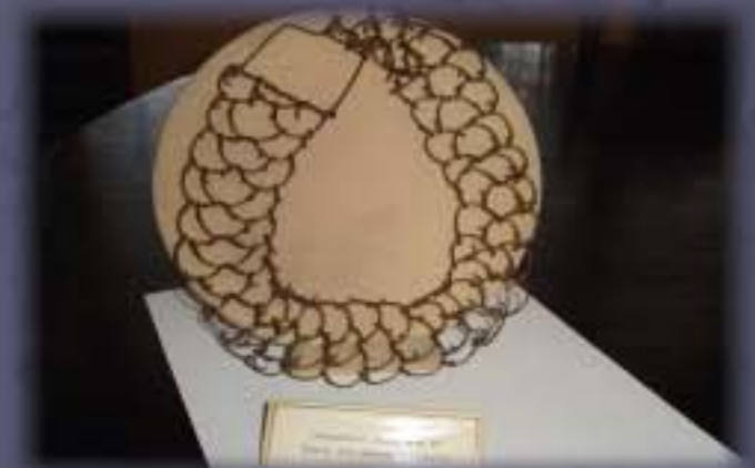
Cilice of Bishop Scalabrini from the late 19th century.