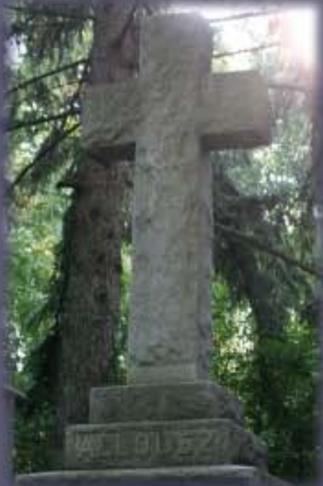
A cross erected near the fort site commemorates Father Allouez, a Jesuit priest at the mission.

Written documents indicate that the Jesuit priests settled among neighboring Native American groups and were successful at creating some converts at the St. Joseph mission.