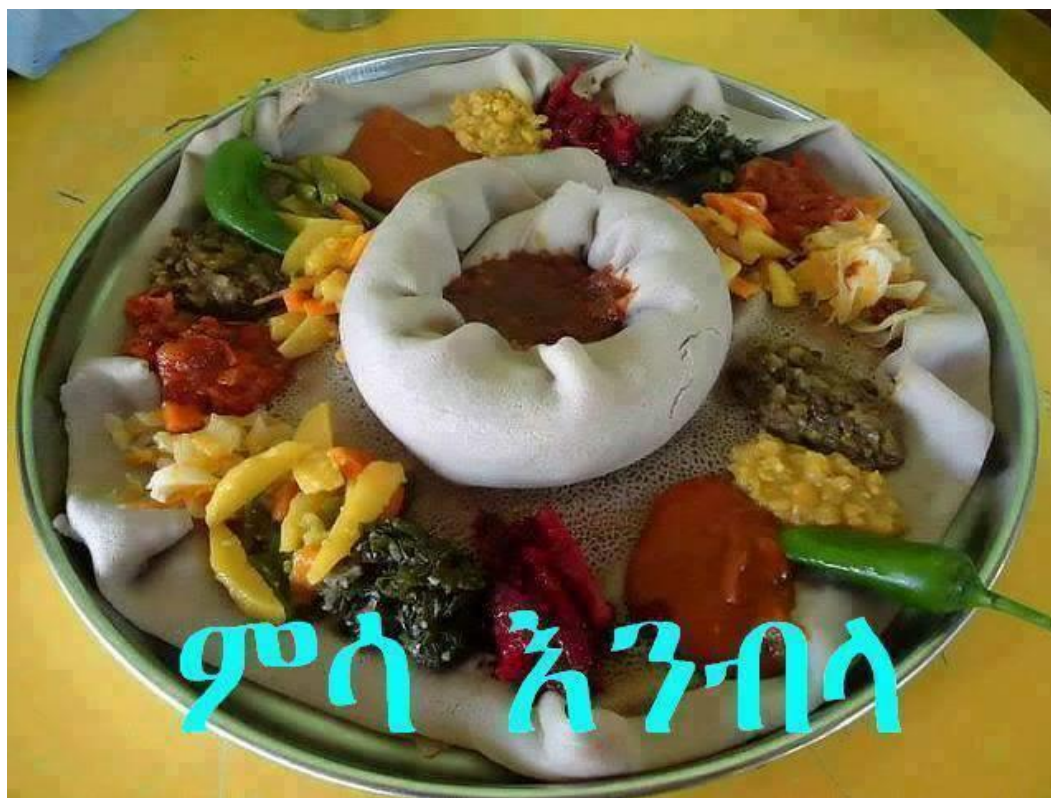
Figure 1: Ethiopian traditional compositing method The righting in this Photo in Amharic says “let us eat lunch.”

Even though, compositing of cereals and legumes is a common practice at house hold level in developing countries, the way of compositing and processing method is different than that of commercially available complementary products. For example, as shown in fig1, in Ethiopia they have been using cereals and legumes to make their daily food. On the other hand, limited cereal and legume types are well known for compositing as a complementary food product in developing countries. For instance, teff is not a well-known grain outside of Ethiopia and it is not widely used in other products except making flat bread (“Injera”). On the other hand, cowpea is not considered as an edible grain by humans and was not used as a food material until recent years.