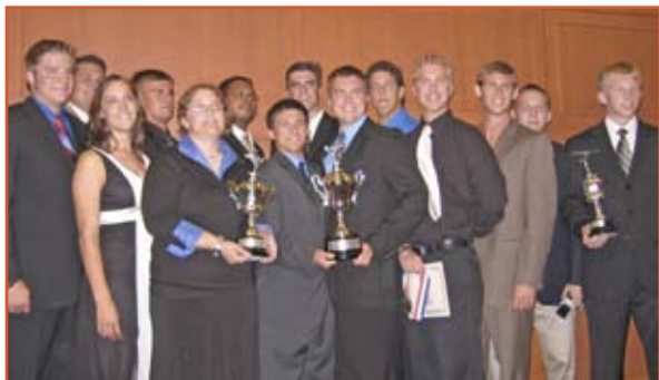
Western Michigan University's precision flight team, the Sky Broncos.

Western Michigan University's precision flight team, the Sky Broncos, captured the National Intercollegiate Flying Association's Region