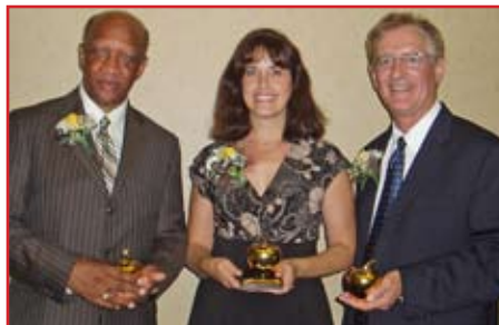
2007 Golden Apple Award Winners.

are personally selected by their peers as representing educational excellence and commitment.