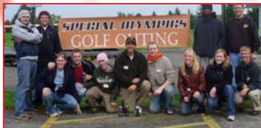
HPER 3710 Students/Special Olympics/Unified Sports Golf Outing.

The class raised money, solicited donations and prizes, managed registration, and conducted the outing. All the athletes and participating partners walked away with prizes. It was a huge success and everyone had a great time!