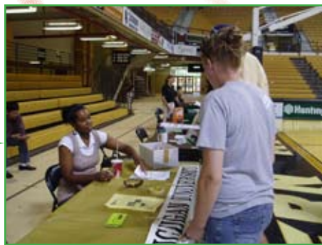
Health, Physical Education and Recreation