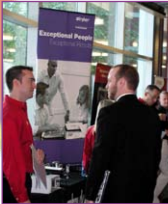
Stryker Instruments, which sponsored last month's 2007 Engineering Opportunity Day, was located just inside the front door at the Parkview Campus. Stryker offers a variety of internships, co-ops, and full-time positions. The company offered a career fair preparation workshop prior to EOD. Stryker is a generous contributor to and supporter of WMU.