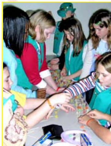
Girl Scouts work in teams to build gum drop bridges at a previous Society of Women Engineers' Girl Scout Workshop.

The WMU student chapter of the Society of Women Engineers is coordinating an Engineer for a Day workshop for Girl Scouts from the