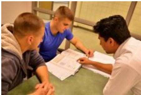
Students gather to study.