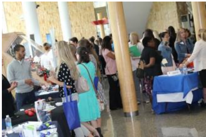
Nursing students and vendors in the atrium during Nursing Assembly Day.

Dozens of health care vendors filled the atrium at the CHHS building. Nursing students were able to speak with the vendors about potential job and extern opportunities in addition to learning about their products and services.