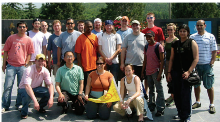
WMU professors and students who traveled to China.

This summer 18, students and professors – mostly from engineering and science – spent 25 days in China absorbing the culture, listening to college lectures, touring cities and