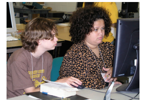
The middle-school students worked in dyads to build their robots.