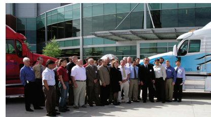
Some of those who attended CAViDS' first conference pose with truck exhibits from Eaton Corp. and Dana Corp. in front of CEAS Parkview Campus.