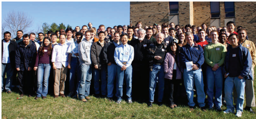
About 110 students and professors attended the 33 rd annual Midwestern Fluid Mechanics Conference (Mufmech) at Lake Wawasee in Rochester, IN.