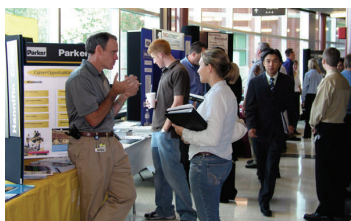
A scene from last year's EOD.

fair provides students with information about where to find internships, co-ops and full-time jobs," she said. No pre-registration is required to attend. For more information, visit or call (269) 387-2745. Kellogg's is sponsoring this year's fair. The Battle Creek company, which is celebrating its 100 th anniversary this year, was recently identified as WMU's Employer of the Year. "Kellogg's