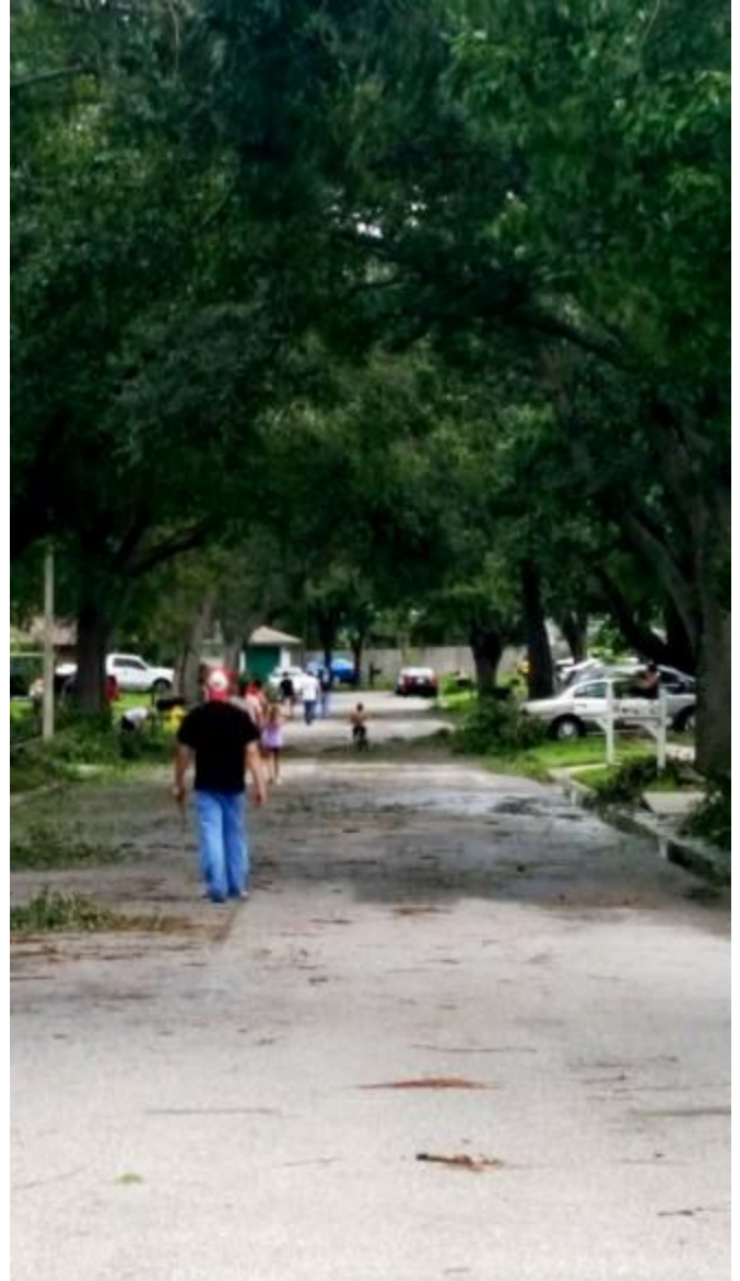
Left: Students hunkered down with friends during Hurricane Irma.