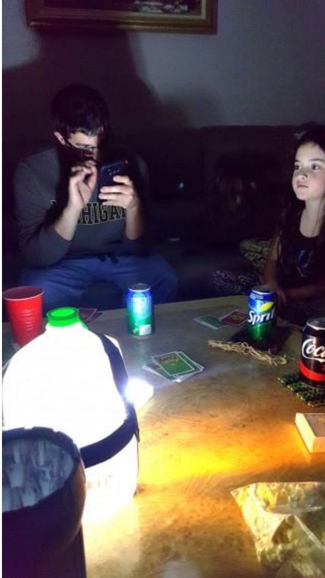
Left: Students hunkered down with friends during Hurricane Irma.