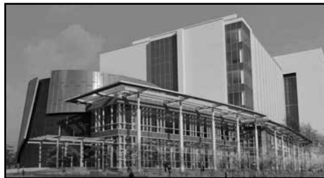
This artist rendering shows how the medical school building will look after renovations are completed.

A groundbreaking ceremony Oct. 12 launched a massive renovation of the downtown Kalamazoo building that will house the WMU School of Medicine and served as the forum for announcing that the school has been granted preliminary accreditation by the Liaison Committee on Medical Education, the national accrediting body for educational programs leading to the Doctor of Medicine degree.