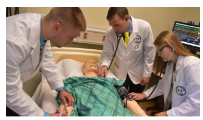
PA students with Sim Man

ARC-PA, the accrediting agency for physician assistant programs, has granted Accreditation-Continued status to WMU's physician assistant program. This accreditation status signifies that the program continues to be in compliance with ARC-PA standards.