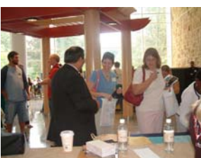
More employers and students