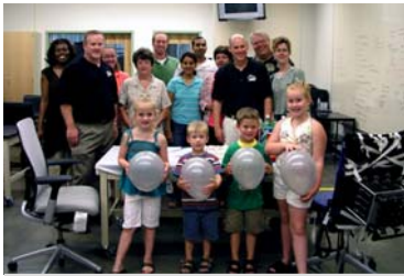
Celebrating the first anniversary of Haworth's new Zody chair are WMU researchers, family members, and other supporters.