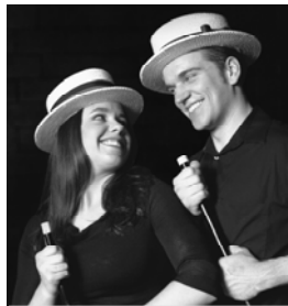
Next Stop Broadway