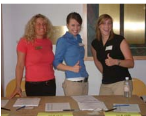
Student nurses at the registration table

This fall, the Bronson School of Nursing held a Nursing fair in which current nursing students met with visiting nurses and nurse recruiters. 26 registered employers attended the event.