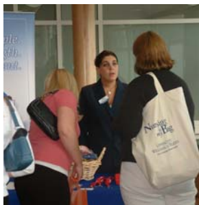
Students talking with employers from Heartland Health