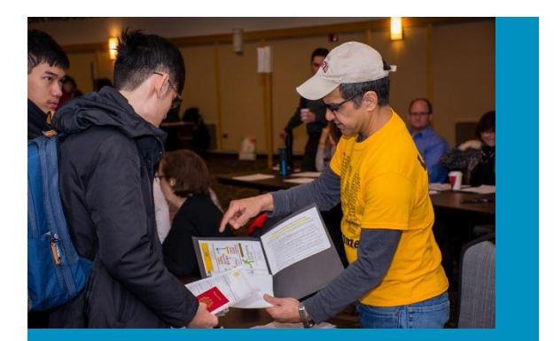
Willing to help new international students at WMU? Sign up to volunteer with us during Summer and Fall International Student Orientations.

If you are interested in being involved in a community of people working to make the greater WMU area a wonderful place to live, complete the volunteer application. This season volunteering sessions start from April 5.