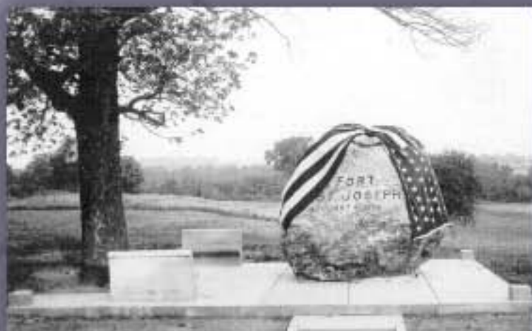
Fort St. Joseph has long been remembered and commemorated in the Niles community.

Louis claimed the territory for Spain, though they remained at the site for only a day. The area became part of the American Northwest Territory in 1805, earning Niles the nickname The City of Four Flags , as the French, British, Spanish and American flags had all been raised at the site.