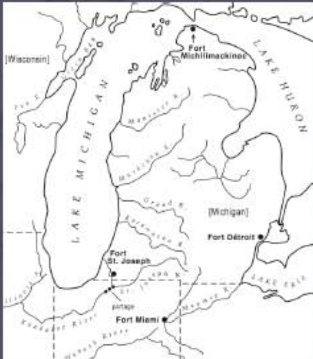
Contemporaneous forts in the area.

The French established Fort St. Joseph in 1691 in present day Niles.