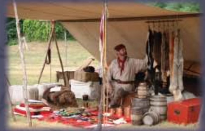
Voyageurs were also a part of the population at Fort St. Joseph.

By the 1730s the fort became an important mission-garrison-trading post complex that supported a military commandant, 8-10 enlisted men, a blacksmith, a priest, an interpreter and nearly 15 additional households. Native populations also lived in close proximity to the fort. Interactions in the vicinity of the fort created a multi-ethnic community. The post came under English control in 1761 and was attacked by the Potawatomi during Pontiac's Rebellion two years later. The fort was never re-garrisoned and French traders remained there until 1781 when a small contingent from St.