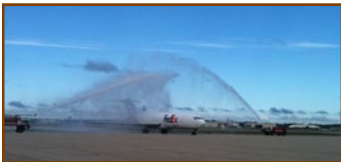
FedEx/OBAP Boeing 727 Arrival