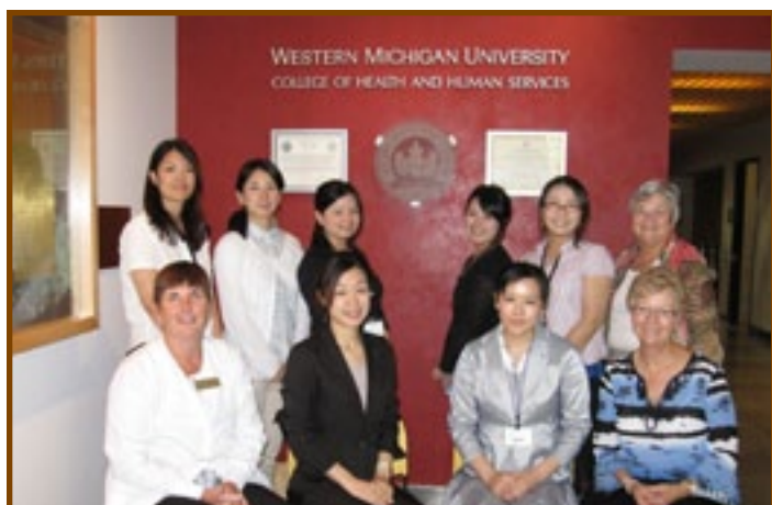
Nursing students from Shiga University of Medical Science visit CHHS