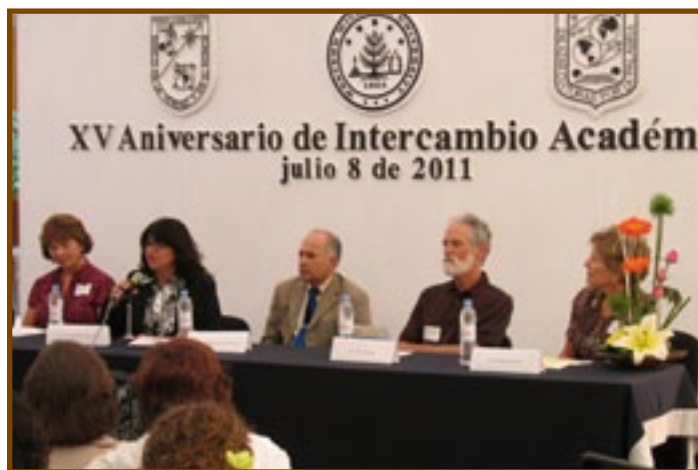
Reunion in Querétaro