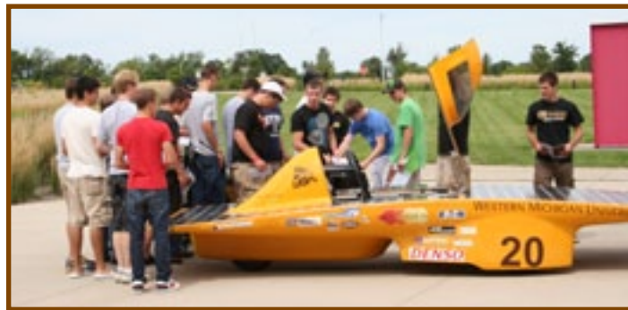
A group of new students checking out the solar car with Sunseeker team members.