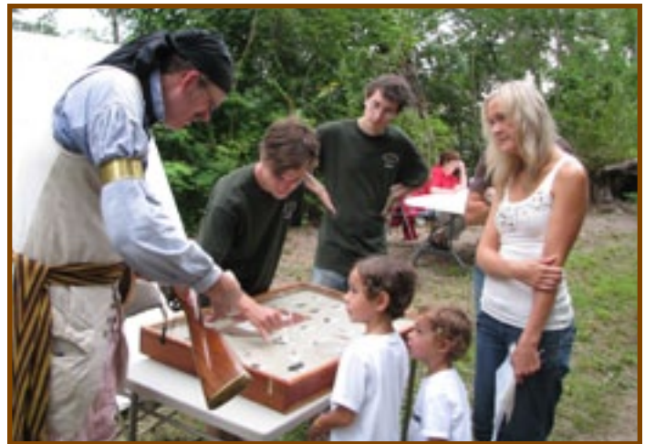
Annual FSJ open house draws visitors to the site