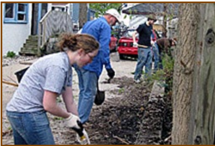
Students help clean up neighboring communities