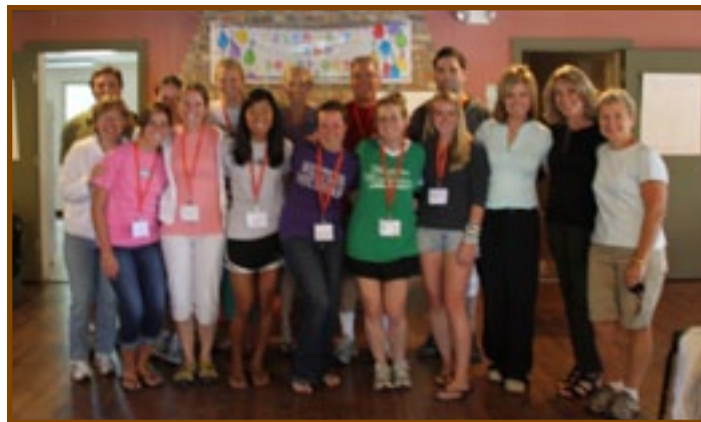
Camp Shout Out Participants