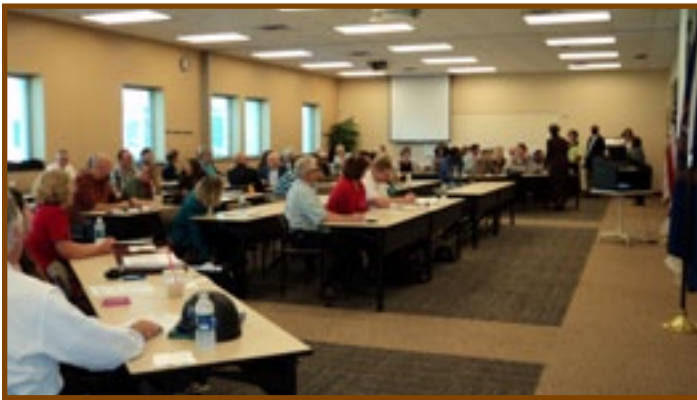
WMU sponsors Michigan's first Small Business Association Tour